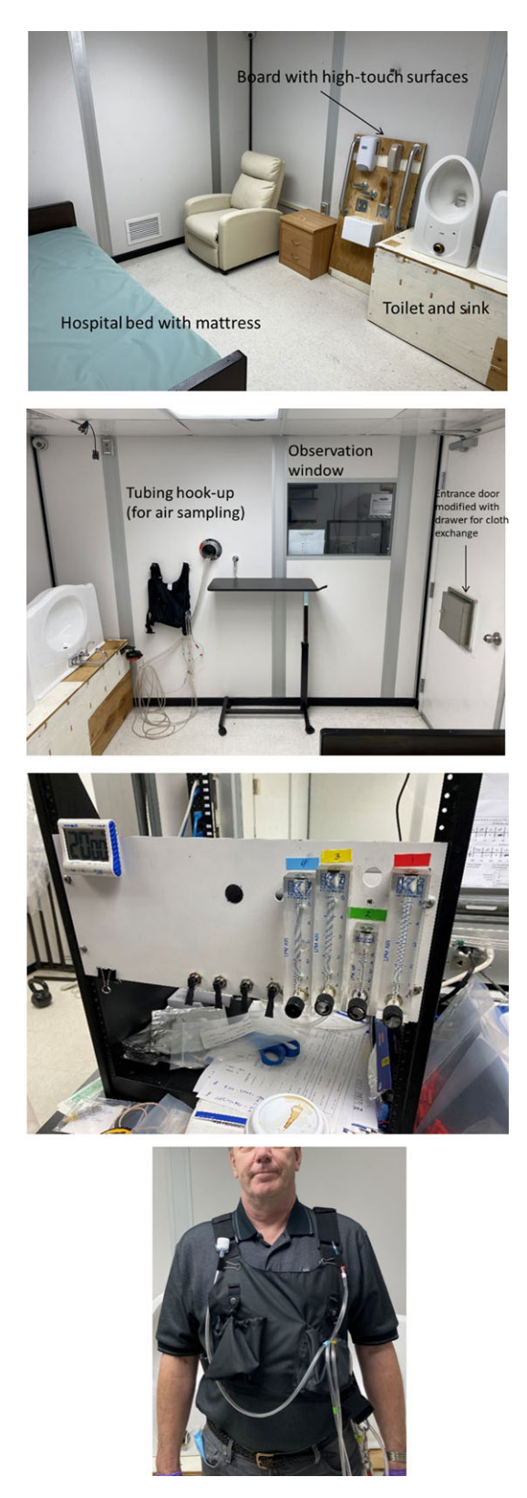
Fig. 1. Chamber configuration and equipment at the Monell Chemical Senses Center. Top 2 photos: Environmental chamber configuration with furniture and high-touch surfaces, sample tubing hook-up, and chamber entrance door, which was modified with a drawer for cloth exchange. Third from top: Sample collection manifold constructed with 4 key instrument rotameters and a Gast DOA P707-AA vacuum pump. Bottom: Customized sampling vest, with Tygon tubing from the 4-channel sample collection manifold to the breathing zone of the volunteer and connected to the sample cartridges.

or nasal congestion or dripping). Further details on the irritation metric methods and data collected are reported in Supplementary Appendix 3.