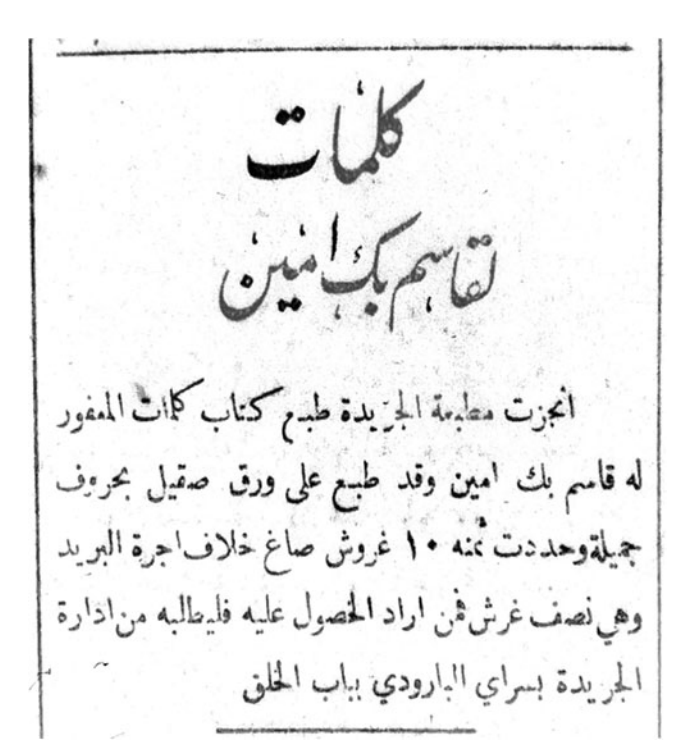
Figure 2. Advertisement for the Kalimat in al-Jarida , June 2, 1908.

of five.<sup>67</sup> Even al-Liwa <sup>2</sup>, which had a more subdued coverage of Amin's death, praised the Kalimat as "proof of the merit of the deceased and the clarity of his vision."<sup>68</sup> In total, fifty-eight of Amin's aphorisms were quoted in eight different publications.<sup>69</sup> Most aphorisms were cited only once or twice, but eighteen appeared three or more times.<sup>70</sup> One of the most oft-quoted aphorisms seemed to hint at a détente that many of these eulogists sought; it began: "The fanaticism of the people of religion and the arrogance of the people of science is the source of the apparent conflict between religion and science. It is not correct that there is a true difference between them, now or in the future."<sup>71</sup> Amin then went on to give each side its due—science for its drive toward discovery, and religion for its understanding of the unknowable. This conciliatory tone struck a chord with six different publications.<sup>72</sup>