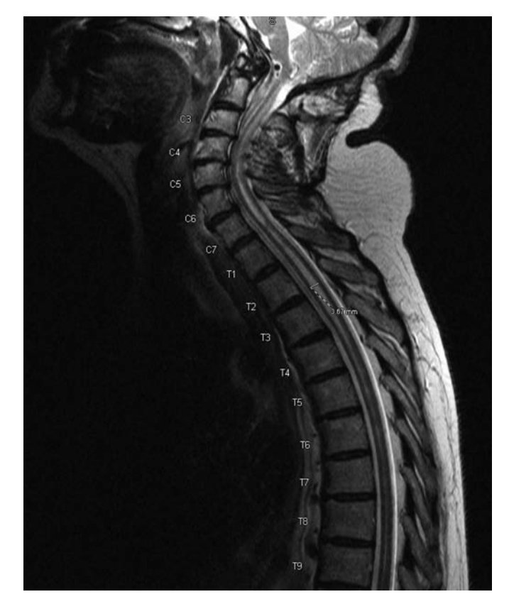
Figure 2: Sagital imaging of the spine following FM decompression, showing a decrease in the diameter of the syrinx.