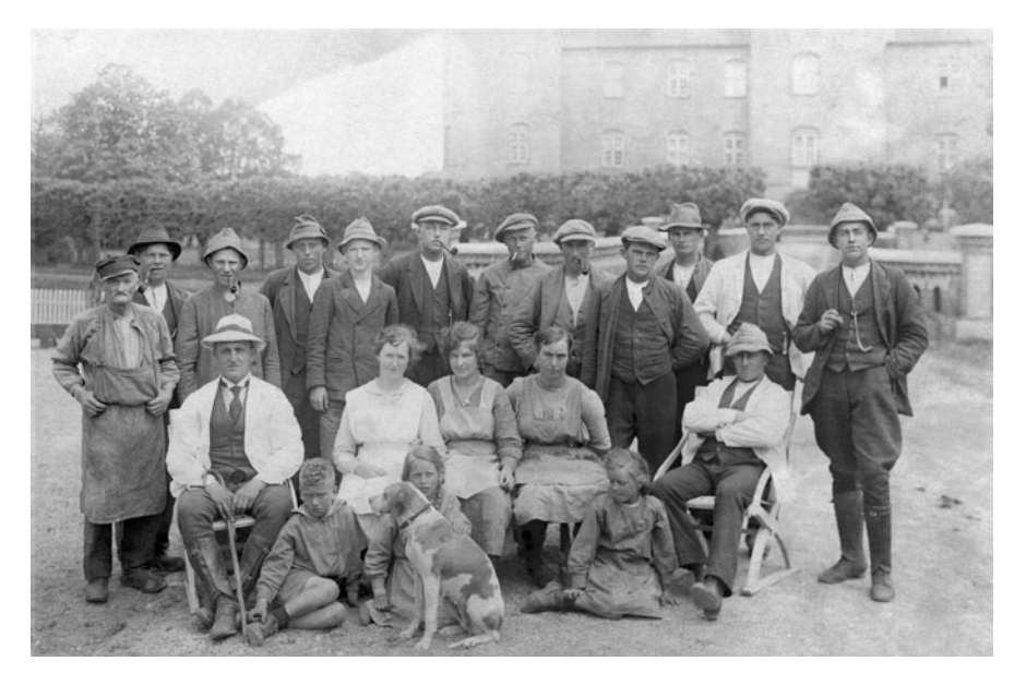
Figure 2. Workers and servants in front of Gammel Estrup Manor in 1918. The Servant Law of 1854 abolished Danish estate owners' right to punish servants with a physical chastisement. However, servants' disobedience towards estate owners continued to be illegal and could now be sentenced in court.

result in a prison sentence on a diet of "water and bread" for five to ten days unless other paragraphs in the law dictate more severe punishment for a similar offence. However, regarding the punishment of underage servants, §27 stipulated that if they had been subjected to corporal punishment for one of the offences mentioned in §26, they could not also be fined. This meant that the heads of household could choose whether to chastise or fine underage servants – but they could not subject these servants to both forms of punishment for the same offence.