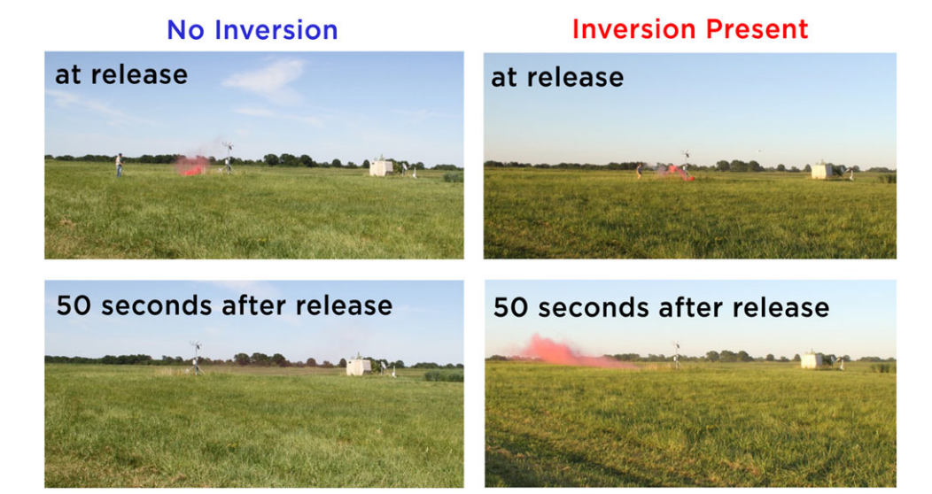
Figure 5. Smoke bombs released at the same site in Columbia, Missouri (2017), during unstable, noninversion conditions (approximately 4:00 P.M.) and inversion conditions (approximately 7:30 P.M.). The smoke plume has dissipated by 50 s following release during noninversion conditions while the plume remained intact during stable conditions.

elevation differences. The larger depth (height) of such a drainage system requires more turbulence or stronger vertical winds to disrupt. Consequently, drainage systems in fields along river bottoms can persist longer and move farther, which provides an opportunity for pesticides to be transported over long distances.