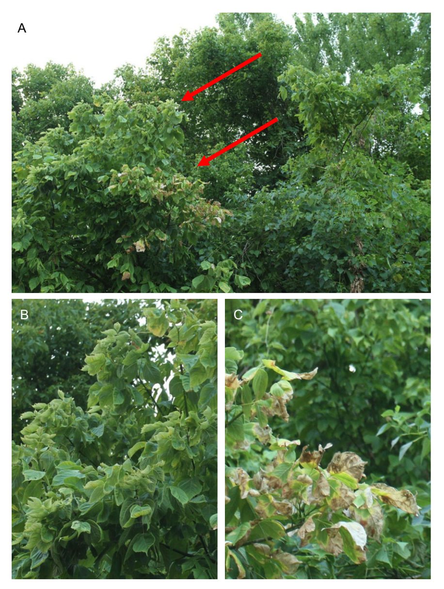
Figure 4. A few meters into the nearest tree line from where the smoke bomb was released (Figure 3), sporadic damage that resembled dicamba and glyphosate injury was observable in the trees. Red arrows point toward dicamba and glyphosate symptoms. (B) Enlarged image of injury resembling leaf cupping or leaf rolling, typical of dicamba. (C) Enlarged photograph of the generalized chlorosis and necrosis of the younger leaves associated with glyphosate injury.

Similar to inversion formation, the drainage strength, depth, and structure are influenced by many factors (Barr and Orgill 1989). Drainage flow on a downward slope is likely to be shallow in depth on much of the agricultural land in the United States given a lack of vertical elevation differences (McNider and Pielke 1984). However, even smaller disruptions to the topography, such as terraces, may restrict or influence the flow pattern of cool air drainage (Mahrt et al. 2001). In a study conducted in southern Kansas and on a terrain that varied in elevation from 450 to 475 m AGL, cool air drainage was observed during evenings. However, the flow was always weak, and the layer of cool air was typically thin (usually 3 m or less AGL). Flow was typically disrupted during the evening and would reform on some evenings, but not consistently (Mahrt et al. 2001).