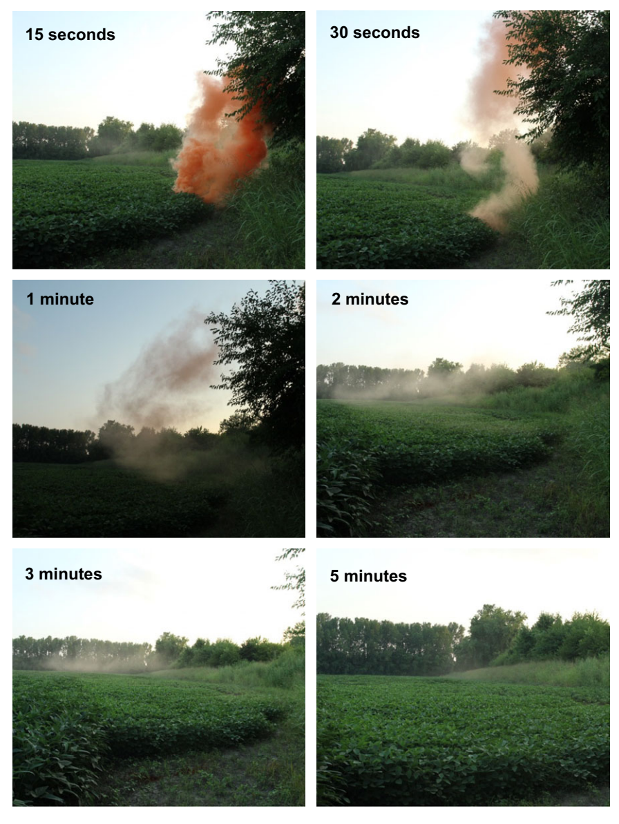
Figure 3. A time-lapse series following the release of a smoke bomb at a soybean field adjacent to a pipe river. The river is on the other side of the distal tree line. The visible plume first moved vertically. As the plume reached the height of the tree line, between 30 s and 1 min, it began sinking, which is likely the result of being incorporated into a cooler air stream. The particulate did not disperse but moved as a dust cloud to the low point in the field, where it remained visible for 3 min. (These particular smoke bombs, Enola Gaye smoke grenades, are designed to emit an observable plume for 90 s.)

variation in duration length and dissipation times of inversions at Albany compared to the other two locations (Bish et al. 2019b). Inversions at the Albany location were typically much shorter and more variable, whereas inversions at the Hayward location typically persisted through the evening, lasting on average 12 h. At the Columbia, Missouri location, inversions lasted approximately 11 h in April and became shorter as evenings grew longer, averaging approximately 7 h in length by July. Disruption of inversions occurred between 5:00 A.M. and 7:00 A.M. consistently at Hayward and Columbia, whereas this varied substantially at Albany.