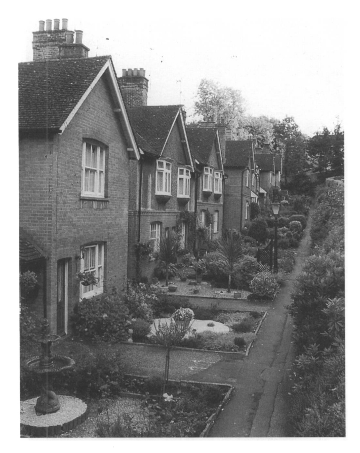
Fig. 2. Sevenoaks: Holyoake Terrace, looking south (1906–07)

Garden Suburb, or even Brentham. It seems unlikely that Unwin fulfilled anything beyond an advisory role in planning Sevenoaks, and the appearance of the houses, and the surviving drawings, does not suggest Unwin's hand.