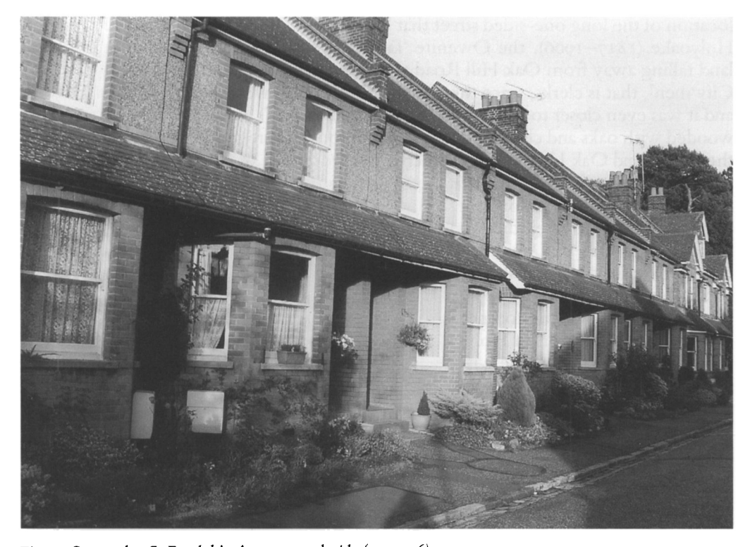
Fig. 1. Sevenoaks: St Botolph's Avenue, north side (1905-06)

tenants. The first three were built for the society by a commercial builder in a terrace that appears at first sight to be one house, with a central gabled dormer and the front doors for the two outer houses in the side walls. By the time these were completed, close links with the original co-partnership estate in Ealing meant that the society was able to follow Ealing's example and employ direct labour on the rest of the houses, with Fred Watts from Ealing Tenants Ltd acting as clerk of works. <sup>15</sup> By building themselves, the society saved, it was estimated, around twenty-five per cent.