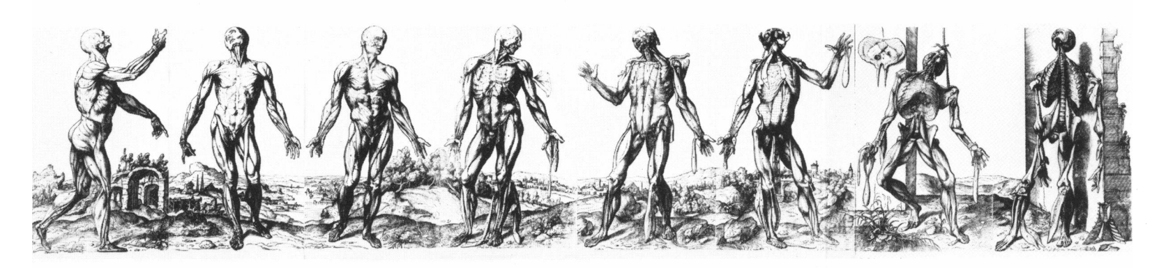
Above and below, the full sequence of fourteen muscle-men in revised order; i.e., printed in reverse from the Fabrica , but probably in agreement with the original drawings.