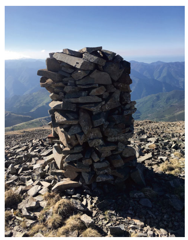
Fig. 7. Modern cairn on the northwest spur of Polut Dağı (photograph by SGB, 2017).

In terms of the earlier discussion of the river intersection at Maçka (see 'Central Sector (East)'), this is an interpretation (a) case: having crossed the boundary river, the army would also have had to cross the Karadere. For this