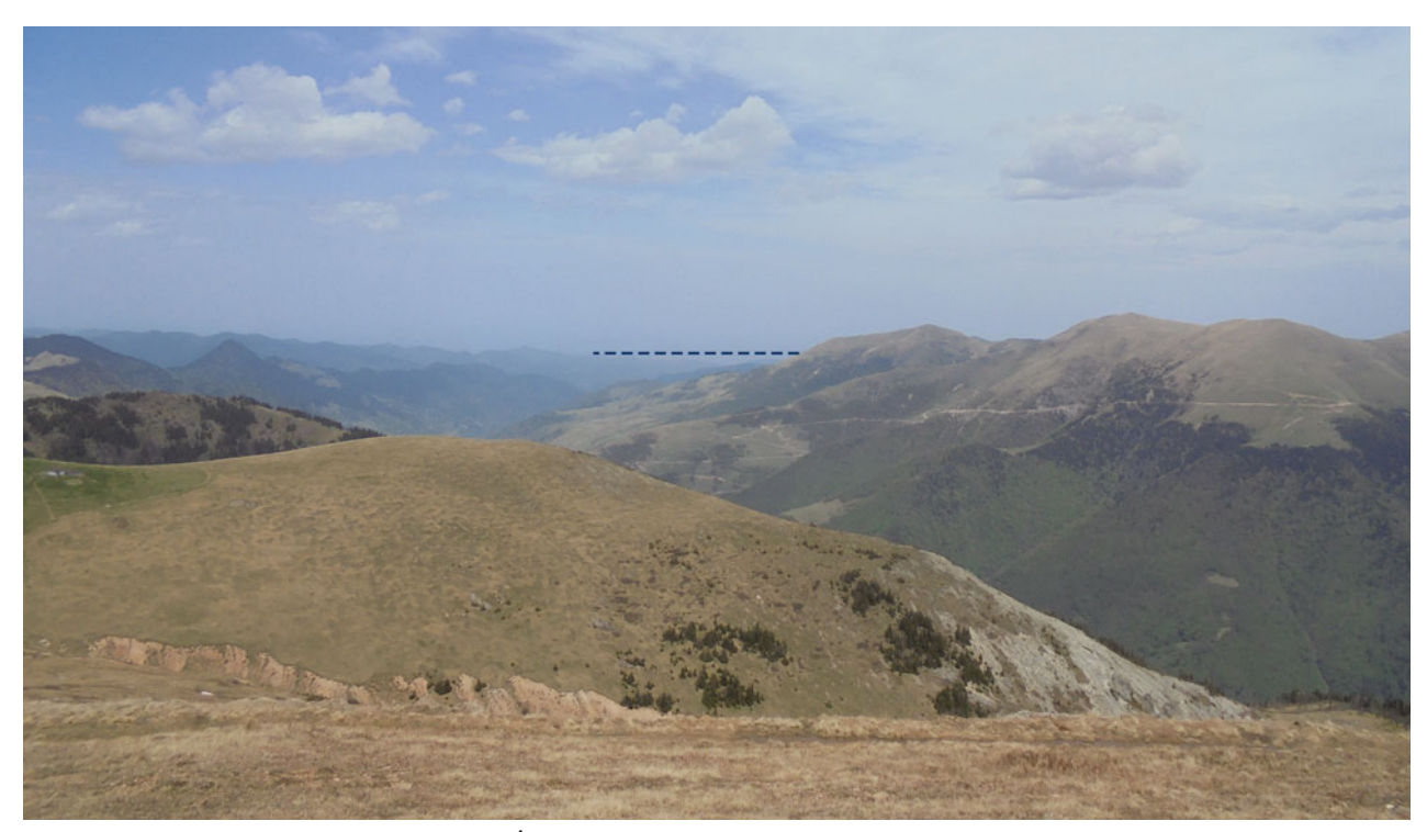
Fig. 2. View north from the height above İskobel yaylası; the dotted line indicates the horizon where the sea is visible.

Local claims that İskobel is the thalatta thalatta spot may be bolstered to some degree by Gassner's investigations (see below), but the association with Selim II can hardly be correct: Dr Mitford (in written correspondence) wonders if it is really a story about Mehmet II, who approached Trabzon from the south at the time of the conquest of the Empire of Trebizond in 1461. In any case, belief in such things, together with the reports about early 20th-century caravans, presuppose that the İskobel plateau is on a viable cross-mountain route, and that seems reasonable, given that such a route can theoretically be traced on Google Earth starting at Arzular, just north of the Bayburt-Gümüşhane road, and going north either through Dölek or (more circuitously) through Yayladere, and eventually passing to the east of Deveboynu Tepe (the 3,000+ metre peak immediately south of a small lake called Cakirgöl). If it be thought that the akron in Xenophon's account is a separate high spot (see earlier discussion), the craggy ridge above the western side of the plateau could answer that description. It is true that there are places slightly to the south of Iskobel whence the sea could be seen, but they are not immediately adjacent to the road, and it seems likely that İskobel (and its adjacent akron) is the first satisfactory vantage point for the northbound traveller that meets the requirements of Xenophon's description.