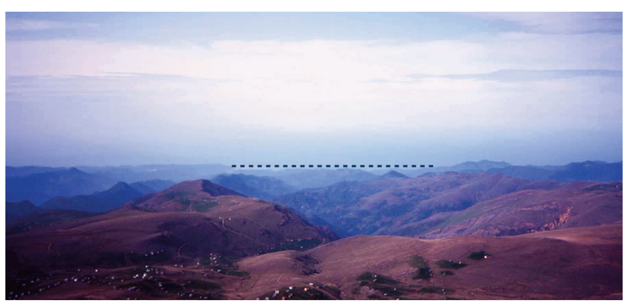
Fig. 5. View north from the Madur Dağı ridge; the dotted line indicates the horizon where the sea is visible (photograph by SGB, 2001).

incidentally there is a striking view to the south, a sea of white-capped mountain tops extending as far as the eye can see. The mass of the mountain, a physically much larger feature than the craggy Madur peak described above, initially blocks any view north, but as one rounds its western side, the view opens up, revealing about 3km to the north a spur of the mountain. Standing at 2,315m, this prominent feature imposes itself as an attractive candidate for the place from which the Ten Thousand saw the sea (40.673 N 39.963 E) (fig. 6).