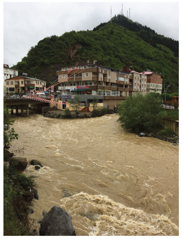
Fig. 3. Confluence of the Sumela and Değirmendere at Maçka (photograph by SGB, 2017).

What Xenophon says is that the army came 'to the river which separates the land of the Macronians from that of the Scythenians' (4.8.1). At this point they had very difficult terrain on their right and another river on their left. 'The stream marking the border flowed into this second river, and the Greeks had to cross it' (4.8.2). There seem to be two ways of envisaging the situation. (a) The boundary river is the tributary, flowing from right to left into the river-from-the-left (which runs from left to right). This is undoubtedly the natural way of reading the text. (b) The boundary river (flowing left to right) merges with the river-from-the-left (also flowing left to right) on the other