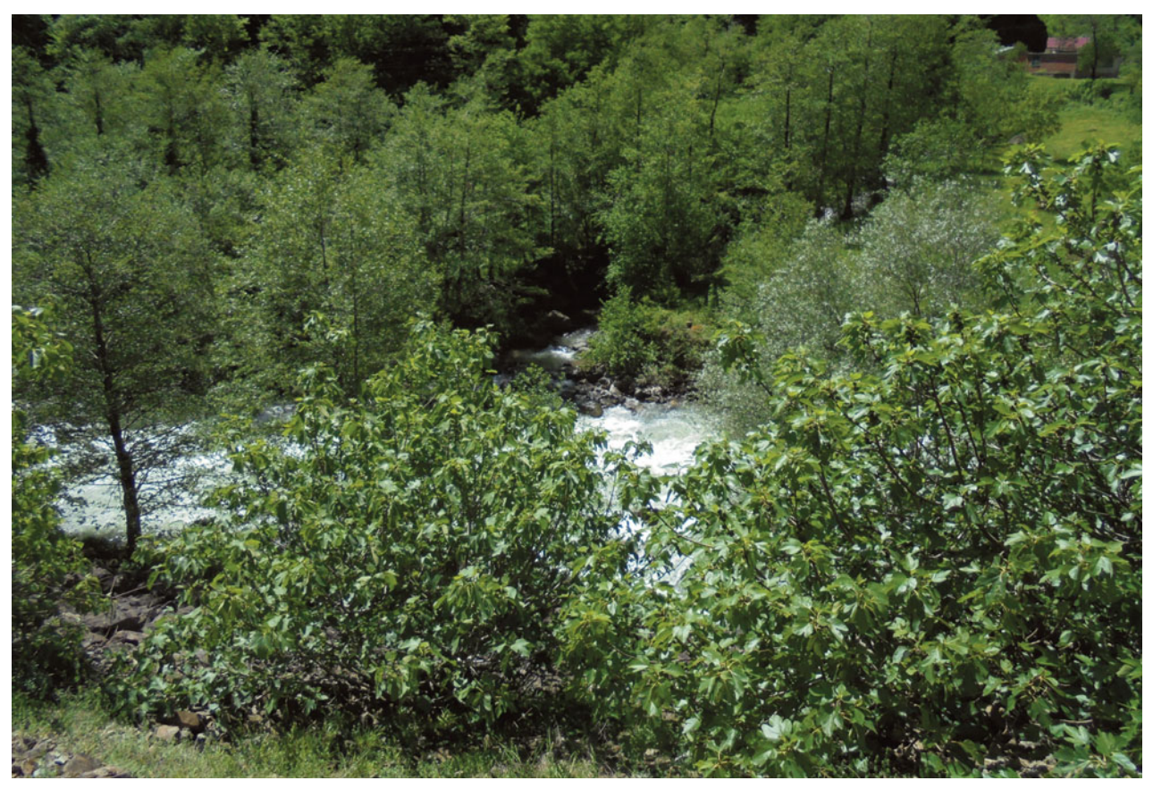
Fig. 8. Confluence of the Karadere and an unnamed river (photograph by CJT, 2017).

there are two options. Either they crossed immediately, turned back slightly on themselves and proceeded west up a cleft in the mountains immediately opposite the point at which they had entered the area, or they went down the right (east) bank of the Karadere for some kilometres and crossed near modern Erenler, where there is another, perhaps slightly easier, way into the mountains to the west. Both ways forward might eventually have brought them to Gassner's route to Trapezus described above. The downstream option presupposes the existence of a path on the east bank, where there is currently just a tree-covered mountainside. It should be remarked that both sides of the Karadere in this sector are steeply sloping, and the modern road on the left (western) bank is the product of engineering.