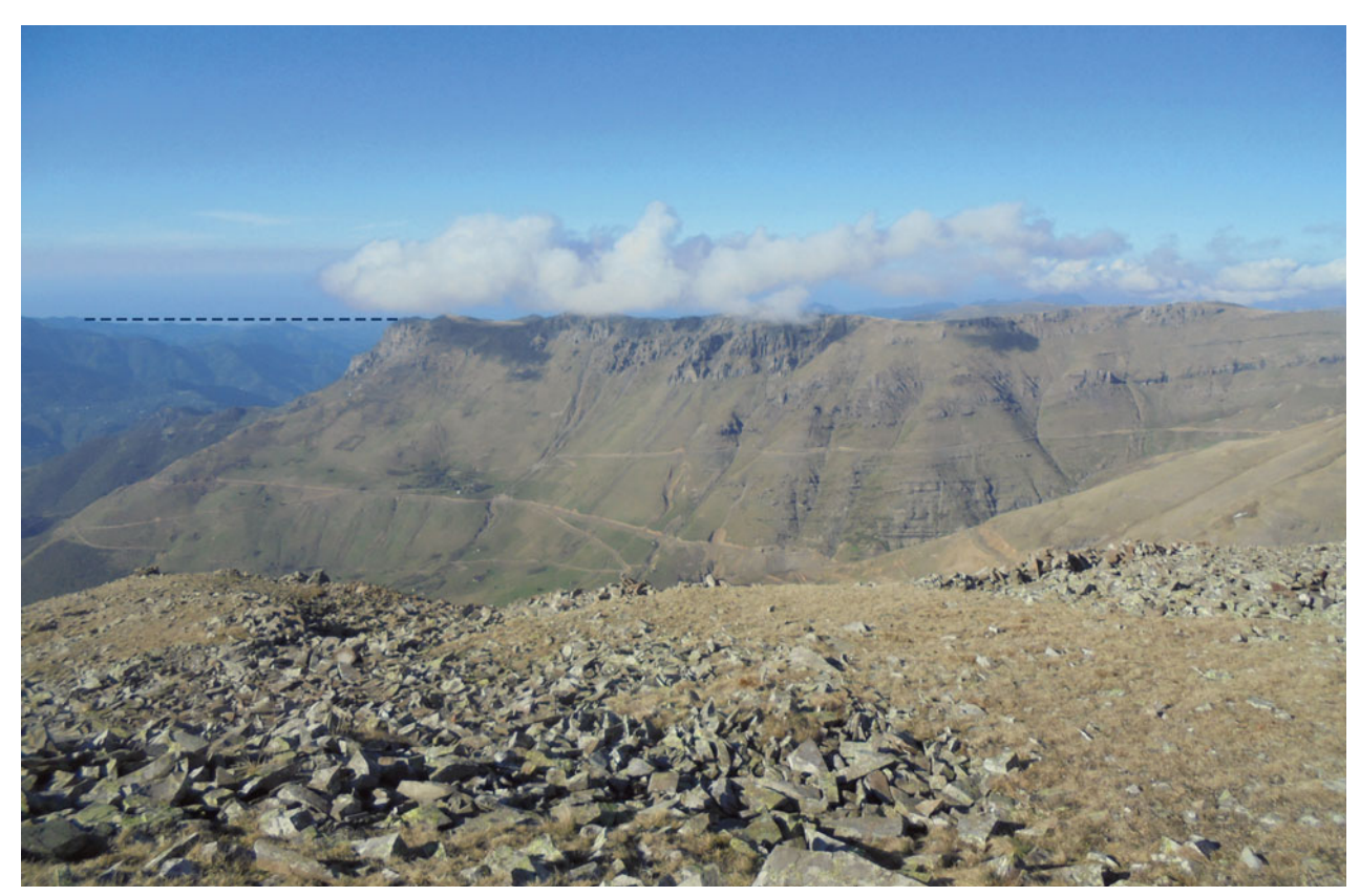
Fig. 6. View north from the northwest spur of Polut Dağı; the dotted line indicates the horizon where the sea is visible (photograph by CJT, 2017).

the mountain on its northern side and climbs up the other side to complete the trip on its southern flank or does the whole descent along the slopes on the southern side. (Modern villages are on the higher ground, not in the valley bottom.) In either case the immediate approach to the river junction is down a quite steep crag; in this respect, the set-up rather resembles Mitford's scenario at Maçka.