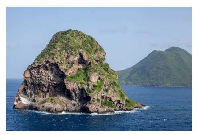
PLATE 2 Diamond Rock.