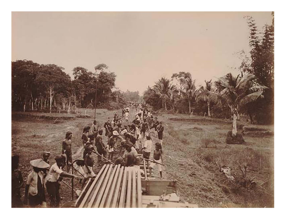
Figure 1. Forced labourers at work repairing a railway line for the Aceh tram at Meureudu on the stretch from Sigli to Samalanga. 1905. KITLV 90437. Creative Commons CC-BY License.

(VOC). The VOC employed convicts for hard labour in various urban public works and on five convict islands: Onrust and Edam (near Batavia), Rosingain (Banda), Robben Island (Cape of Good Hope), and Allelande (Tuticorin). On the islands, convicts were employed at the wharf, the rope factory, or in collecting limestone, shells, or wood. The urban public works ( gemeene werken ) consisted of convict quarters ( kettinggangerskwartier ) from where convicts were sent out mainly to work on infrastructure (roads, canals) and fortifications.<sup>6</sup> This system remained in place after the VOC's possessions had been assumed by the Dutch state (1815) following an intermediate period of British rule. Power was only effectively transferred after April 1816.