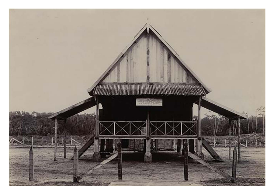
Figure 2. Accommodation in the Bengkulu residence at Seluma for herendienst conscripts from Aer Priokan. 1920. KITLV 32353. Creative Commons CC-BY License.

new colonial state further developed a refined system of mobilization of labour through compulsory labour services ( herendiensten ) in combination with the compulsory cultivation of market crops ( cultuurstelsel ). This entailed large-scale corvée by local populations, employed for plantation work, infrastructure, and public services. The simultaneous increase in corvée and convict labour was not coincidental. These forms of coerced labour were deeply connected, and their rise was related to the changing landscape of possibilities available to the colonial state in employing labour.