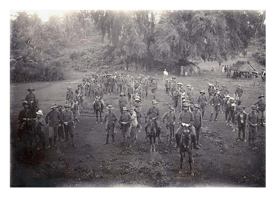
Figure 5. Transport of guns by four columns of forced labourers from Aceh, during the seventh Bali expedition. 1906.

Colonel Bauer's regiment to join the expedition to Bonjol in 1835.<sup>47</sup> During the Timor expedition of 1857, the 250 "press-ganged coolies" were soon replaced by convict labourers. After the conquest of the Lampong region (South Sumatra) in 1859, it was reported that "in those and following years a great number of regiments of forced labourers and chained convicts were transported from Anjer via the Sunda Straits to Teloengbetoeng for the construction of roads and the rebuilding of this city".<sup>48</sup> The expeditions during the colonial wars in Aceh between 1873 and 1903 were accompanied by some 500 to 1,000 convicts yearly. Van Heutsz's 1898 expedition included more than 3,800 convicts.<sup>49</sup> Convicts were employed in other colonial wars simultaneously. The Lombok expedition of 1894 included some 1,000 convicts, while 250 convicts were sent with the New Guinea expedition in 1902, and some 500 convicts were sent on the expedition to Korintji (west coast of Sumatra)