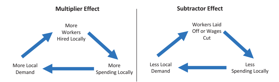
Figure 2 Local multiplier effects

The takeover of a local firm by PE means that value will be transferred out of the local economy in two ways. Consider if a PE firm buys a previously owned local manufacturing plant. First, the PE owner will be remote: retained earnings and the securitization of the existing capital value of the real estate, facilities, and other such assets are transferred out of the community. Income and profits will be sent to the headquarters of the PE firm and the bank that holds the debt used in the leveraged buyout and no longer circulates in the local community. Second, in the search for greater efficiencies, the PE firms will likely fire employees, cut wages, trim healthcare benefits or pensions – extracting more income from the local economy. With new ownership, supplier relationships will likely change, and goods and services previously sourced locally are now sourced elsewhere, further decreasing the local multiplier effect. The reduction or elimination of this local spending decreases not only the direct spending but also the multiplicative impact of that spending. Moreover, the community becomes more vulnerable to economic shocks.