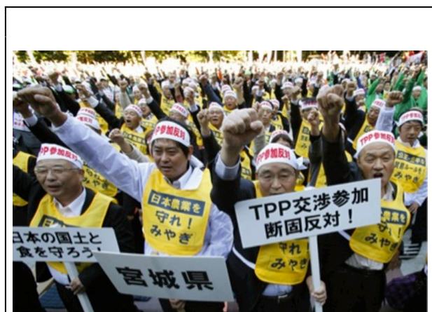
Miyagi farmers in 2011 demonstration in Tokyo: Protect Japanese agriculture

In the 21 st century, one would expect trade negotiators to try to do better than striking down an established system, even one with serious flaws, in the absence of effective protections. The TPP, if it is to be at all acceptable, should do better than the WTO on a range of issues from environmental protection to limits on corporate abuses. Critics of WTO note that it is on record as challenging domestic laws that would bar dolphin meat in tuna products, complicate protecting sea turtles from getting killed in shrimpers' nets, and make it difficult to impose higher pollution control standards on imported gasoline. The general public, of course, if given a say, would strongly urge trade negotiators to improve such a system that came out of complex global negotiations over 20 years ago. Other controversial WTO cases have involved trade in timber logged from tropical forests and attempts to ban imports of meat from cattle treated with growth hormones. There is also one case in which a country was able to keep its domestic ban on asbestos, which an asbestos exporting country had tried to strike down. If the WTO offered at best weak environmental protection, all signs point to the TPP as watering down even these minimal restraints. [ Citizen Trade - WTO & Environment ] 5