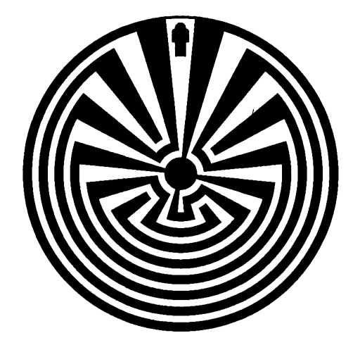
Figure 2 "Man in the maze" on the unofficial O'odham flag. Image in the public domain. http://commons.wikimedia.org/wiki/File:O%27odham_unofficial_flag.svg.

and Akimel O'odham (Pima) art, baskets, jewelry, and the unofficial flag of the O'odham Nation.<sup>5</sup> The labyrinth represents the choices one encounters along the journey of life. In some versions of the story, the labyrinth is also a map to or from I'itoi's cave, located somewhere beneath the sacred Baboquivari Mountain on O'odham land. The image could also provide an apt metaphor for the twists and turns of the collective history of the Tohono O'odham people and nation.