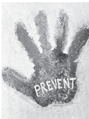
Title: In Our Hands , 2023

Beginning with volume 43 (January 2022), the cover of Infection Control & Hospital Epidemiology (ICHE) will feature art inspired by or reflective of topics within the scope of the journal and their impact on patients, healthcare personnel and our society. These topics include healthcare-associated infections, antimicrobial resistance, and healthcare epidemiology. The intent is to feature original artwork that has been created by individuals who have a personal connection to one or more of these topics through their clinical work, research, or experience as a patient or an affected patient's family member, friend or advocate. The goal is to provide readers with a visual reminder of the human impact of the topics addressed in the journal and the importance of the work being done by those who read or contribute to ICHE and by all who are trying to make healthcare safer through the elimination of healthcare-associated infections.