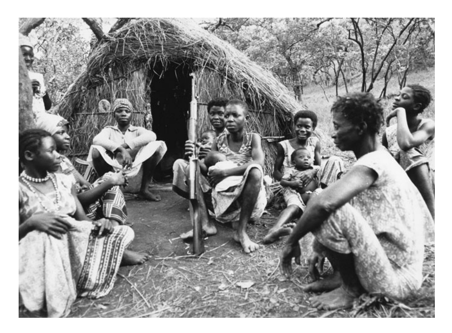
Figure 2. Women in Angola ensure defence of a village displaced into the bush, 1968.

internationalism promoted by the WIDF and the Pan-African Conference of Women. These relationships were established by various means. Women's groups established contact through letters, telegrams, pamphlets, journal articles, and radio programmes. These materials demonstrate their joint participation in conferences and seminars, the organization of international solidarity campaigns, affiliation to international organizations, and the declarations regarding the need for and procurement of material support. To recreate these networks and connections, and to broaden our historical understanding of opposition to Portugal's colonial wars, this article draws on archival and other sources produced by women's groups themselves and on reports produced by the Estado Novo surveillance and control organizations in Portugal and its colonies.<sup>15</sup>