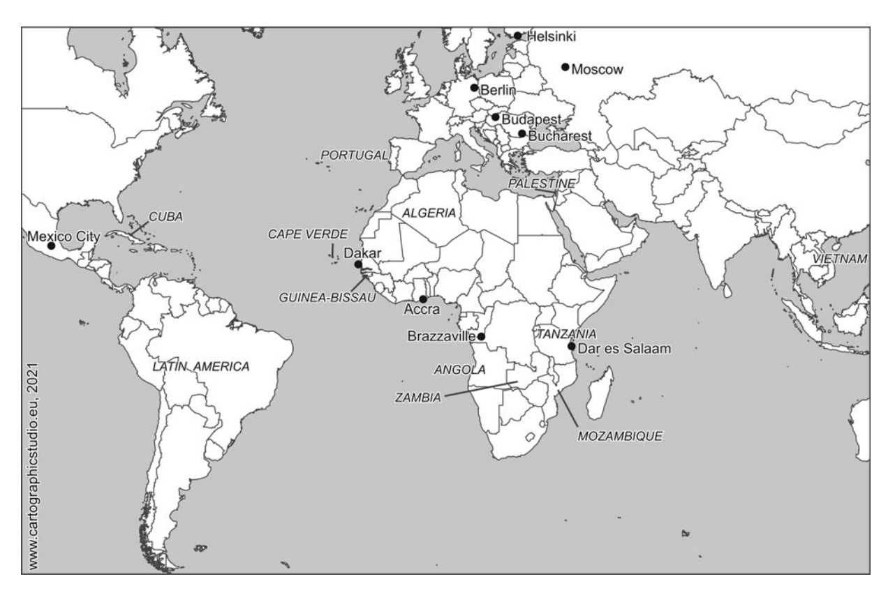
Figure 1. During Portugal's colonial wars women created many opportunities for anti-fascist and anti-imperialist encounters. The map illustrates the places mentioned in the article.