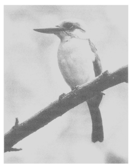
Halcyon gambieri gertrudae, a kingfisher now endemic to Niau.

history of a pair of Vini ultramarina , which was introduced during the 1940s to Ua Huka and which established a healthy population numbering at least 250 pairs today, suggests that genetic problems are not major factors for these species, which naturally originate from a small number of founders.