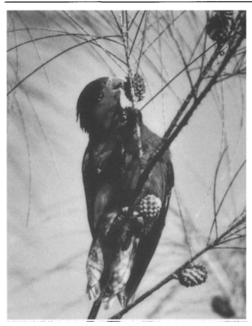
Kuhl's lory Vini kuhlii has a very restricted known original range: the island of Rimatara (Roland Seitre).