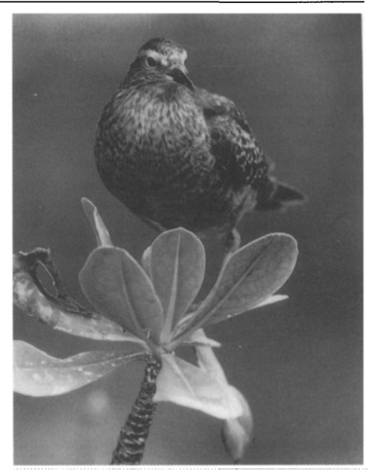
Prosobonia cancellata, the Tuamotu sandpiper might be threatened by Rattus exulans.

interested to discover the effects of different species.