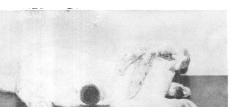
Fig. 1 (a)