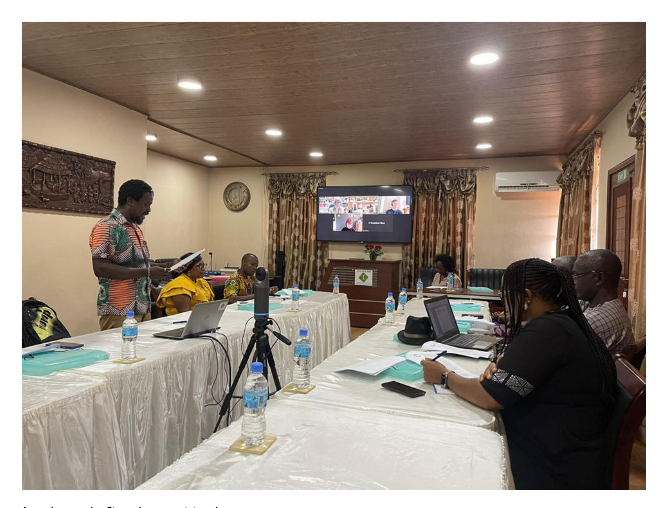
Attendees at the Sierra Leone training day

The chance to network was also very much appreciated, one comment being: "It is really nice for us