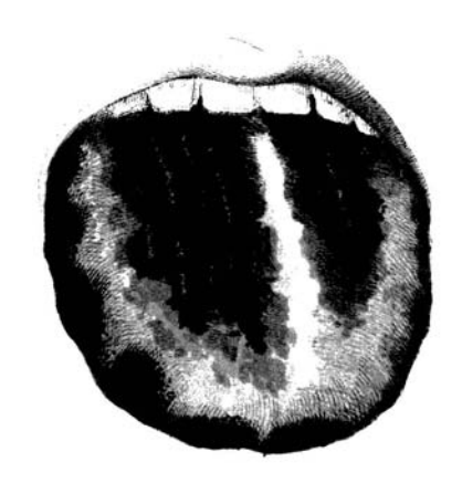
Fig 9. Tonque seen from belown.