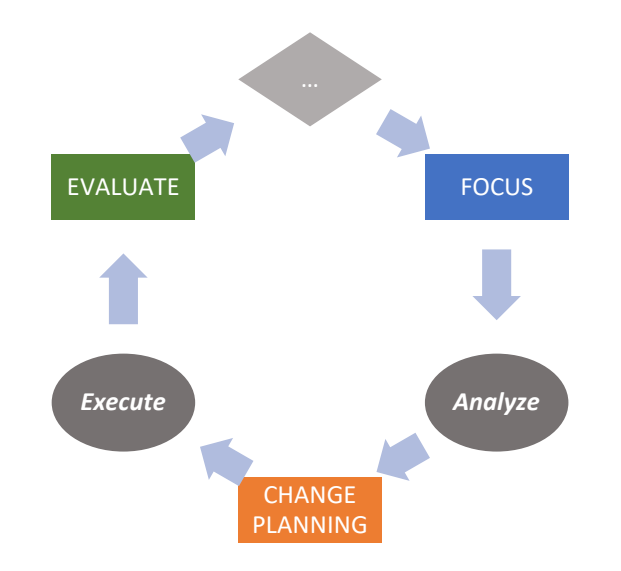
Figure 3: The Focus-Analyze-Change-Evaluate (FACE) cycle