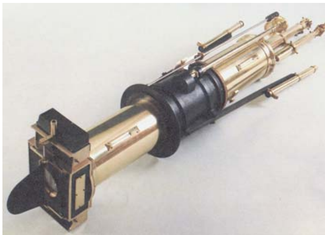
Figure 2. The Dun Echt heliometer (Royal Observatory Edinburgh)

The Dun Echt heliometer (Fig. 2), constructed by the firm of Repsold of Hamburg, was of 4 inches (10 cm) diameter, and was to be handled specifically by Gill who familiarised himself thoroughly with its use at Dun Echt over many months. Preparations did not stop there. Lindsay also acquired a long focus (40 foot or 12.2 m) solar horizontal telescope, fed by a Foucault siderostat (Fig. 3), for photography of the Transit in the manner favoured by the American astronomers; and a 6-inch (15 cm) telescope equipped with a double-image micrometer for visual observations of the Transit as used by the official British expeditions. Together with a splendid portable transit theodolite by Troughton and Simms (Fig. 4), chronometers, and auxiliary apparatus, the Dun Echt expedition was, in the words of Agnes Clerke, "the epitome of modern resource and ingenuity" (7).