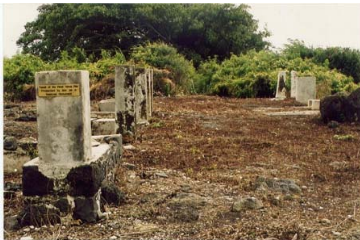
Figure 7. Plaque on the walls of Lord Lindsay's observatory, now a National Monument