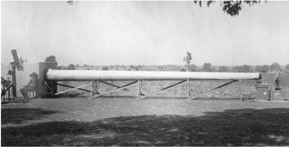
Figure 3. The 40-foot solar telescope, with Ralph Copeland, at the eclipse expedition to Russia in 1887