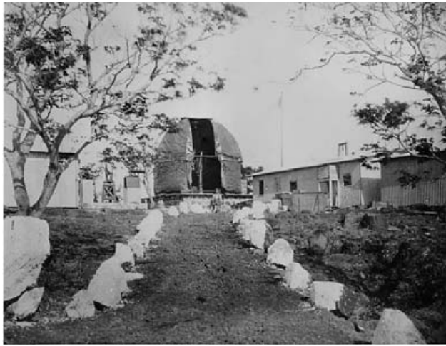
Figure 5. The expedition's observatory at Belmont

site on his estate at Belmont, sixteen miles from Port Louis (latitude 20^{\circ} S), and put his house at the disposal of the astronomers for the duration of their operations (Fig. 5).