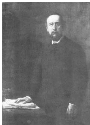
Figure 1. (left) Lord Lindsay, 26th Earl of Crawford and Balcarres and (right) (Sir) David Gill, portrait by George Reid