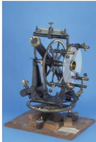
Figure 4. Transit theodolite (Royal Museums of Scotland)