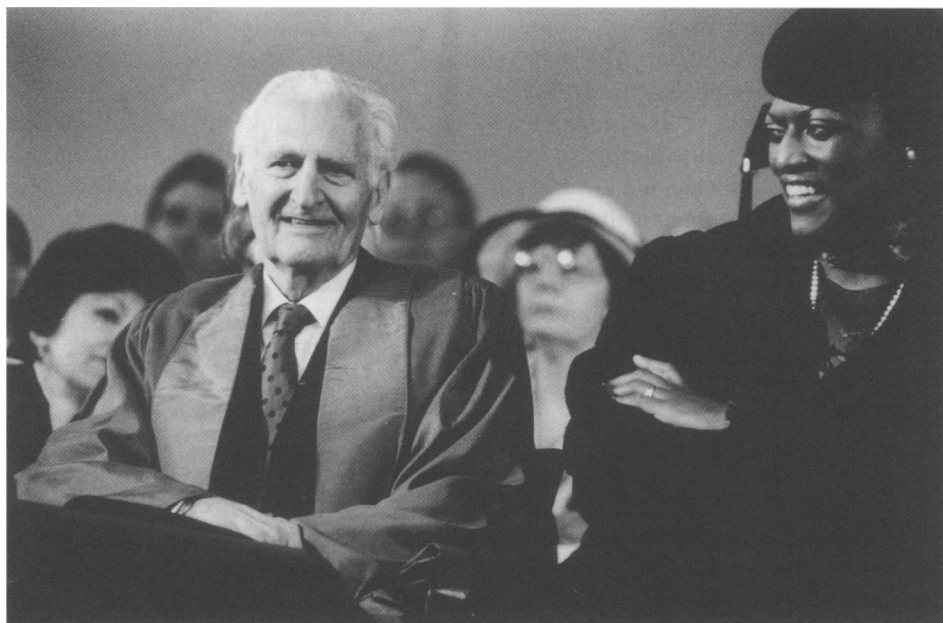
Figure 2: Sir Richard Doll and the operatic soprano Jessye Norman, Honorands, Harvard University Commencement, 9 June 1988. PP/DOL/D.3/59.

collection of Doll's expert opinion is provided by a case against the petrochemical company EniChem, which had asked Doll to review evidence and prepare an expert's report. The collection contains Doll's report ('Cancer caused by vinyl chloride'), together with correspondence with Italian lawyers and background materials for a case that concerned more than 400 workers exposed to vinyl chloride between 1960 and 1993 at the EniChem production plant (the largest in Italy) at Porto Marghera, Venice.