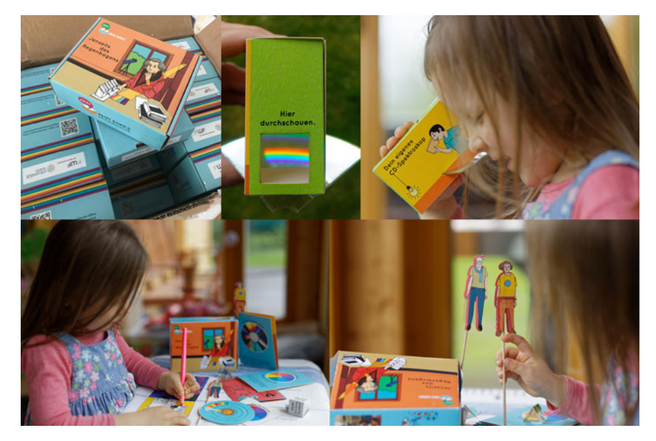
Figure 5. AhalBoxes; solar spectrograph; colouring book; cut out "Herschels".