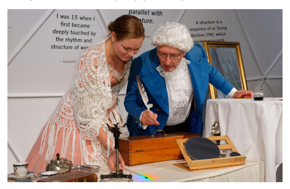
Figure 6. The authors playing Caroline and William Herschel, discovering infrared radiation.

far it was played by scientists (Fig. 6) at big science fairs and exhibitions. It is typically accompanied by topical talks on modern infrared science projects and hands-on activities with infrared cameras. All needed materials and scripts are available in German and English to everybody. Some first schools showed interest to stage the play themselves.