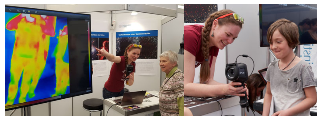
Figure 4. Demonstration of thermal infrared camera at public science fair.

People can experiment by themselves. Several applications in e.g. health or for thermal insulation purposes are easy to understand – and it is really fun!