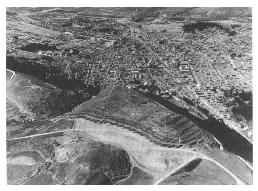
Figure 2. A old air photograph of Cusco from the North-West. The huge hill of the Sacsahuaman is in the foreground, while the "tail" of the Puma is clearly visible in the background, outlined by the two converging roads.

The Inca state –called Tahuantinsuyu or "The Four Parts of the Earth" – was organised according to a centralised framework and was managed thanks to the use of a common language. The state bureaucracy kept an accurate account of the population and economic administration; the data were stored in quipus , clusters of ropes tightened to a main one and laid out as a "tree". Despite the existence of various clues of their existence, there no known surviving quipu carrying written texts, and therefore the only written information we have on architectural, religious and symbolic ideas of the Incas is that reported on the historical chronicles of the Spanish conquest, which are, of course, highly distorted by the viewpoint of the conquerors. Further, some spectacular architectural achievements of the Incas –such as the towns of Pisac and Machu Picchu– were not even cited in them. All in all, at present, all the monuments and the towns built by the Incas remain essentially silent. I shall briefly discuss a case study in which I have recently proposed to use astronomy as a key to unravel at least part of the symbolism which was endowed in Inca town planning (Magli 2005).