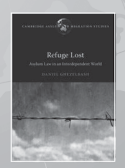
Refuge Lost Asylum Law in an Interdependent World