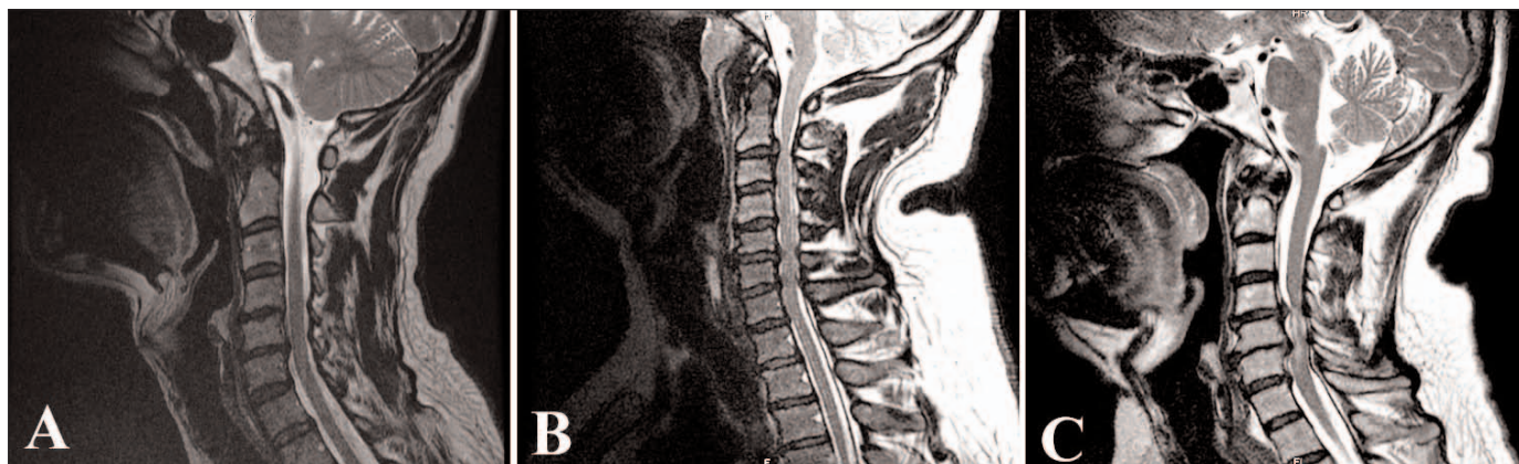
Figure 1: Examples of T2 weighted sagittal MRI scans illustrating (a) diffuse spondylotic changes with effacement of the thecal sac, but no indentation of the cord, (b) effacement of the thecal sac with indentation of the cord, and (c) indentation of the cord with associated increased T2 signal within the cord. These images are provided purely for illustrative purposes and were not available to survey respondents who based their clinical judgment about each case vignette on the verbal description of the MRI scan (Table 1b).

Statistical Analysis. Univariate analysis was used to evaluate survey response rates and to estimate the proportion (and 95% confidence intervals) of respondents recommending surgery for each clinical vignette. Specification was made a priori that frequency estimates of 40-60% would be taken to imply the presence of significant uncertainty regarding optimal therapy. The potential for bias due to the relatively low response rate was evaluated using the ‘continuum of resistance model’. 28 The underlying assumption behind this approach is that every subject in the study population has a position on the response continuum that ranges from ‘will always respond’ to ‘will never respond’. Non-respondents will be concentrated on the side of ‘will never respond’ and subjects who require more reminders before they respond would have been non-responders if the study had been stopped earlier. The late respondents, therefore, most resemble the non-respondents. The proportions of early and late respondents recommending surgery for each vignette were compared using Fisher’s exact test. A p-value of <0.01 was used in order to accommodate multiple comparisons.