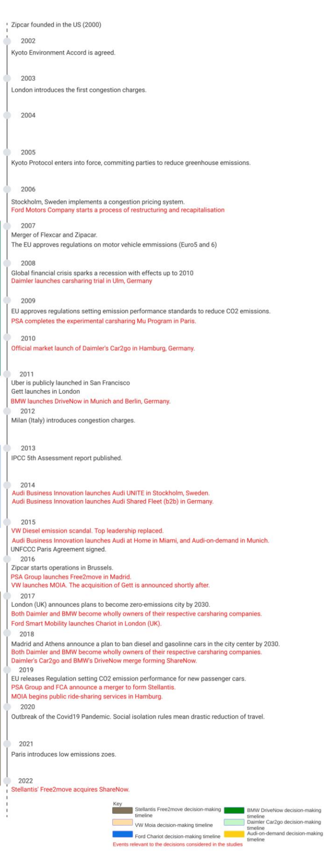
Figure 1. Twenty years of PSS: selected events in the European automotive sector

RQ1: What lessons can be extracted from the initiatives of OEMs to introduce PSS to the European market in the past two decades? What are the implications for lowering the environmental impacts of the automotive industry?