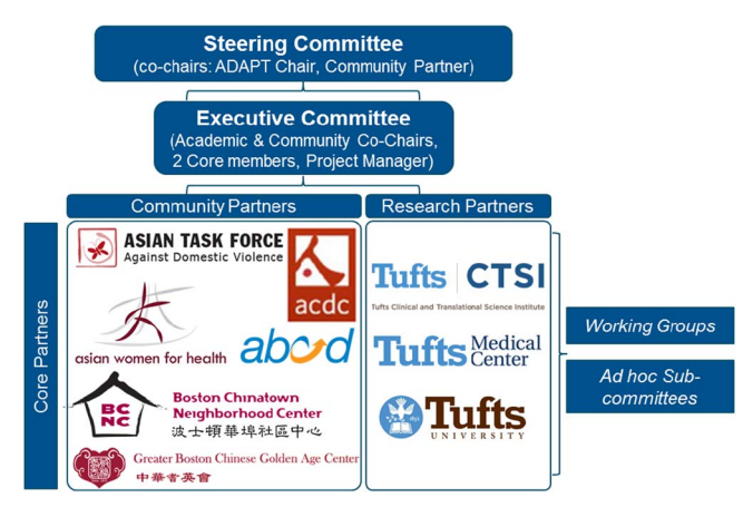
Fig. 3. Addressing Disparities in Asian Populations through Translational Research (ADAPT's) governance structure.

expand its engagement with diverse stakeholders and bring in new members while honoring the time and commitment made by those who have been involved for a long time. Monthly Steering Committee meetings have continued since ADAPT's inception. The meetings are open to anyone interested, and the attendance includes both members of the Steering Committee, other (affiliate) members, trainees, and interested faculty and community.