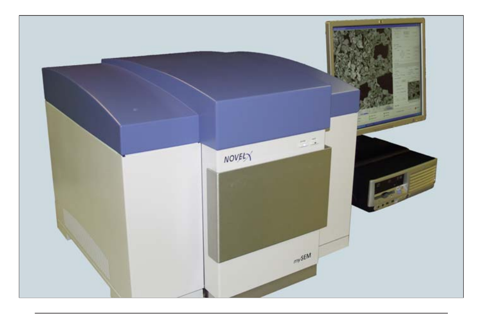
Figure 1: Novelx mySEM, a compact field-emission scanning electron microscope (SEM).

The core technology inside a SEM is the electron beam column whose function is to extract, collimate, shape, scan, and focus the electron beam. The electron optics of a conventional electron beam column rely on precision-machined electromagnetic elements to control the electron beam. At the system level, closed-loop cooling and sophisticated vibration isolation is generally required to manage the high currents in the lenses and to deal with the enhanced sensi-