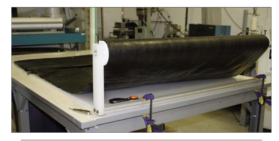
Figure 1. A long roll of carbon nanotube (CNT) cloth, 1.2 m wide with a density of 15 g/m^2 .