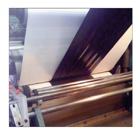
Figure 2. A roll of CNT cloth being prepregged with a commercial resin on industrial machinery.

market for CNT materials is about $90.5 million. Currently, nanotubes represent a niche material market that has high revenue potential. New functionalized nanotubes applications are expected to enter the market in the next few years that are anticipated to greatly increase global revenues to ca. $1.4 billion by 2015, driven by the requirements of the electronics, data storage, defense, energy, aerospace, and automotive industries.