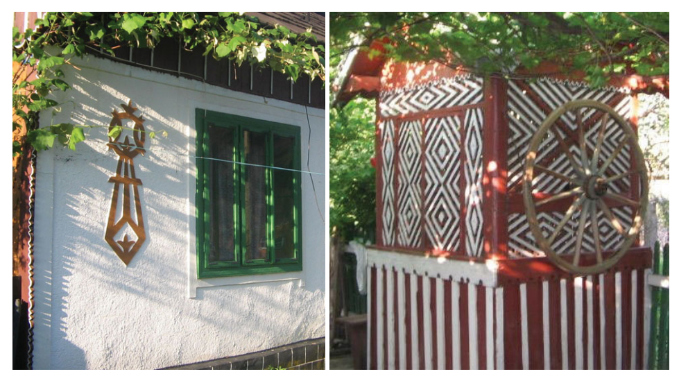
Figure 5. The solar eclipse motif by a window (Left) and on a fountain (Right).