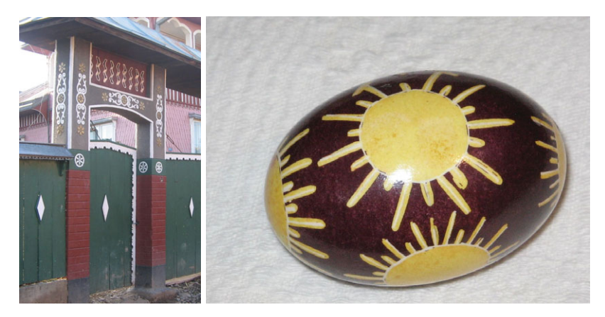
Figure 6. Solar symbols on gateposts (Left) and on a traditional painted Easter egg (Right).