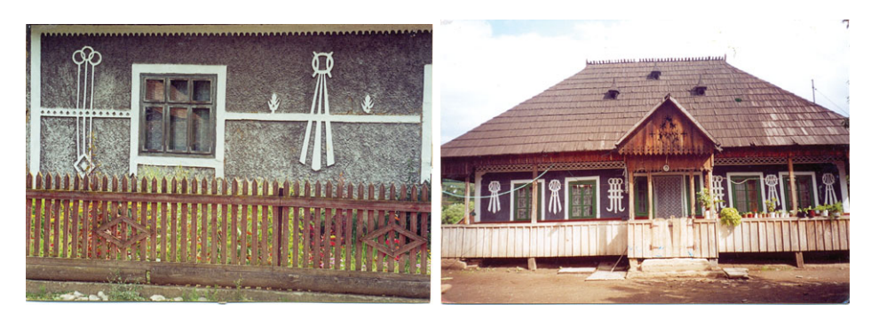
Figure 3. ( Left ) Multiple suns, the three of life, the horizon and a solar eclipse motif. ( Right ) A house with motifs of solar eclipses that looks like an ancient solar temple.