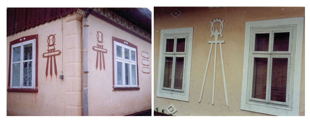
Figure 2. Solar eclipse motifs.