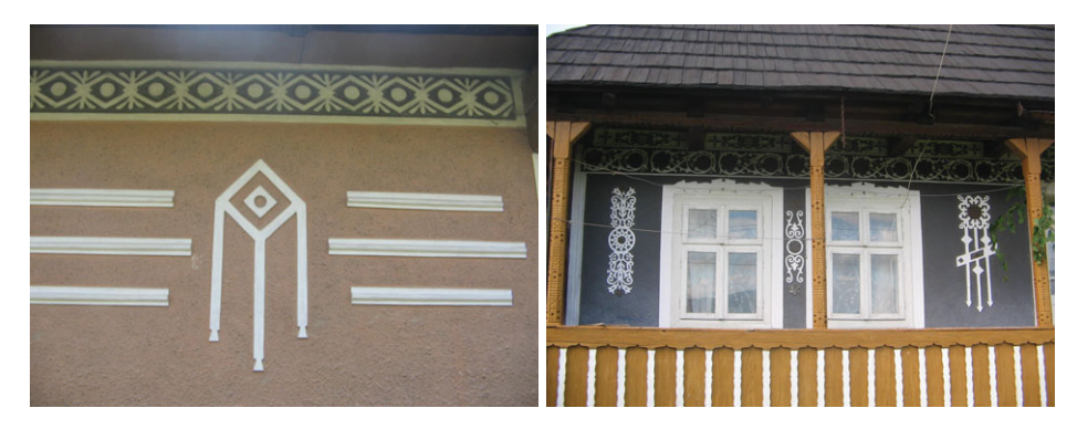
Figure 4. ( Left ) The Sun as the divine Eye that heals and protects. ( Right ) The Sun, the Divine Eye and a solar eclipse symbol on a facade of a house.