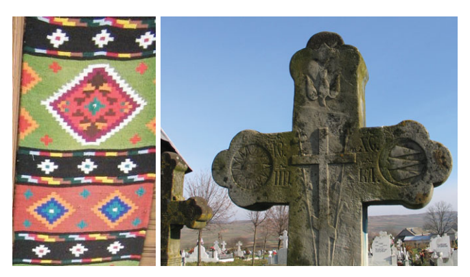
Figure 7. (Left) The Sun stylised on a handcrafted wool carpet. (Right) The Sun and the Moon on a funeral monument.

Figure 6. Solar symbols on gateposts (Left) and on a traditional painted Easter egg (Right).