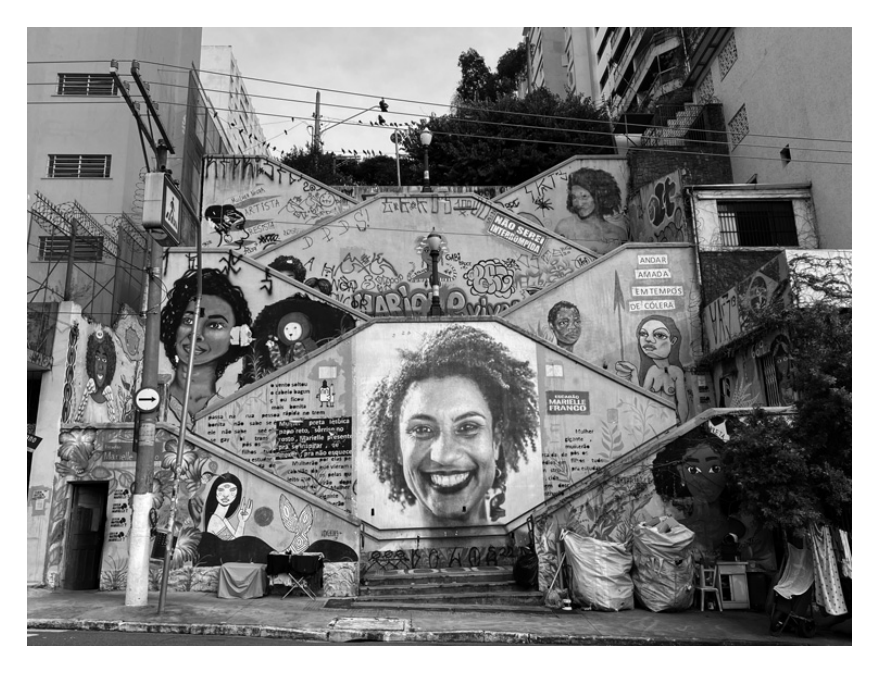
Figure 3.1 Escadão Marielle Franco (Marielle Franco Stairs).