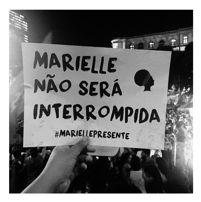
Figure 3.2 "Marielle não será interrompida (Marielle Will Not Be Interrupted)."