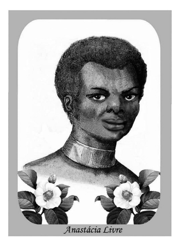
Figure 5.3 Anastácia livre (Anastácia Freed), by Yhuri Cruz.

summarizes with the phrase "equilíbrio entre a raiva e a razão é, então, um exercício diário" ("balancing anger and reason is, then, a daily exercise") (p. 35).