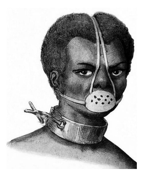
Figure 5.1 Castigo de escravo (Punishment for Slaves) by Jacques Arago (1839). Museu Afro Brasil (São Paulo).

First, we must reconsider the circumstances surrounding the year 2013, in particular the removals of favelas ahead of the 2014 FIFA World Cup and the 2016 Olympics. In a debate at the 2013 Circulando about a documentary produced by activists in South Africa, André Constantine, a member of the