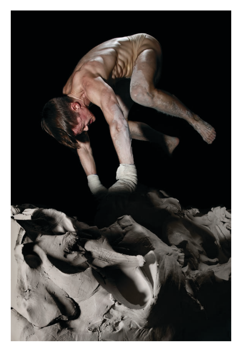
Figure 3. Cassils, Becoming An Image Performance Still No. 1. Edgy Women Festival, Montreal, 2013. c-print face mounted to Plexiglas, 36 x 24 in.

legible categories: these categories necessarily have distorting effects, because they abstract from the particular. There is a dialectical tension between distortion and revelation that mimics and is tied to the nature of value, which organizes the social in ways that can be felt but not always consciously thought or seen.