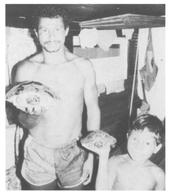
Undersized tartarugas en route to Tefé.

Subsistence hunting is a way of life in many parts of the Amazon basin and is impossible, perhaps undesirable, to prevent. However, commercial exploitation of turtles could, and should, be curtailed. Apart from rare visits by paramilitary Federal Police teams checking up on the cocaine