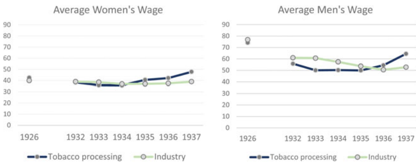
Graph 2. Men's and women's wages in the Bulgarian tobacco industry in comparison with the average industrial wage (levs per day). 31

a consequence of the collective agreements, but to a lesser extent than men's wages (see Graph 2). Thus, following the introduction of the tonga system in the early 1930s, the gender pay gap in the Bulgarian tobacco industry narrowed significantly: In 1926, women tobacco workers earned, on average, 57.33 percent of a man's wage, while in 1932 it was 68.48 percent. The gender pay gap was smallest just before the introduction of the industry-wide collective agreements in 1935, when women earned an average of 81.25 percent of men's wages. After 1937, the gender pay gap increased to around 74–77 percent (see Graphs 1 and 2).