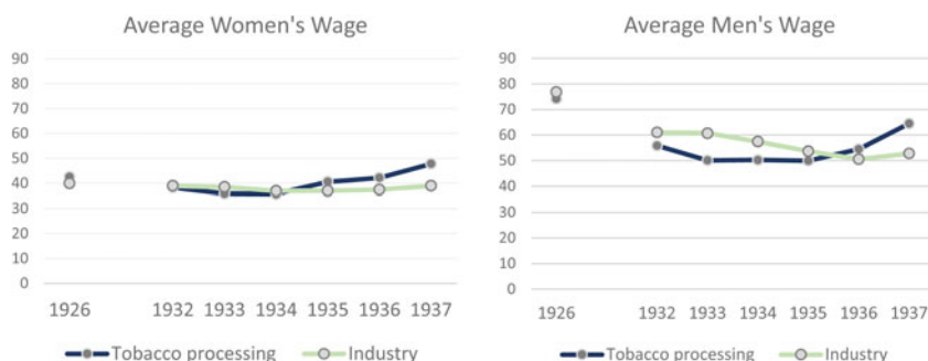
Graph 2. Men's and women's wages in the Bulgarian tobacco industry in comparison with the average industrial wage (levs per day). 31

a consequence of the collective agreements, but to a lesser extent than men's wages (see Graph 2). Thus, following the introduction of the tonga system in the early 1930s, the gender pay gap in the Bulgarian tobacco industry narrowed significantly: In 1926, women tobacco workers earned, on average, 57.33 percent of a man's wage, while in 1932 it was 68.48 percent. The gender pay gap was smallest just before the introduction of the industry-wide collective agreements in 1935, when women earned an average of 81.25 percent of men's wages. After 1937, the gender pay gap increased to around 74–77 percent (see Graphs 1 and 2).