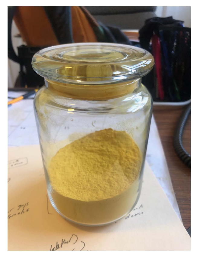
FIGURE 3. Hádńdín in ground powder form.

In his work with the Mescalero Apache Tribe in southern New Mexico, Martin Ball (2000) suggests that pollen is best seen as a tool for the ecological exchange of spiritual/environmental power through prayer and the powers of creation through the four directions. A major component of Mescalero prayers is praying for the ecological integrity of the local environment—"bringing blessings