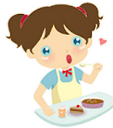
Figure 1. Images displayed for one of the sentences in the Iconic/Natural/Before condition, “The girl blew out the candles before she ate the cake.” The image on the left reflects the correct response to “What happened first?” and the right-hand image is the foil.