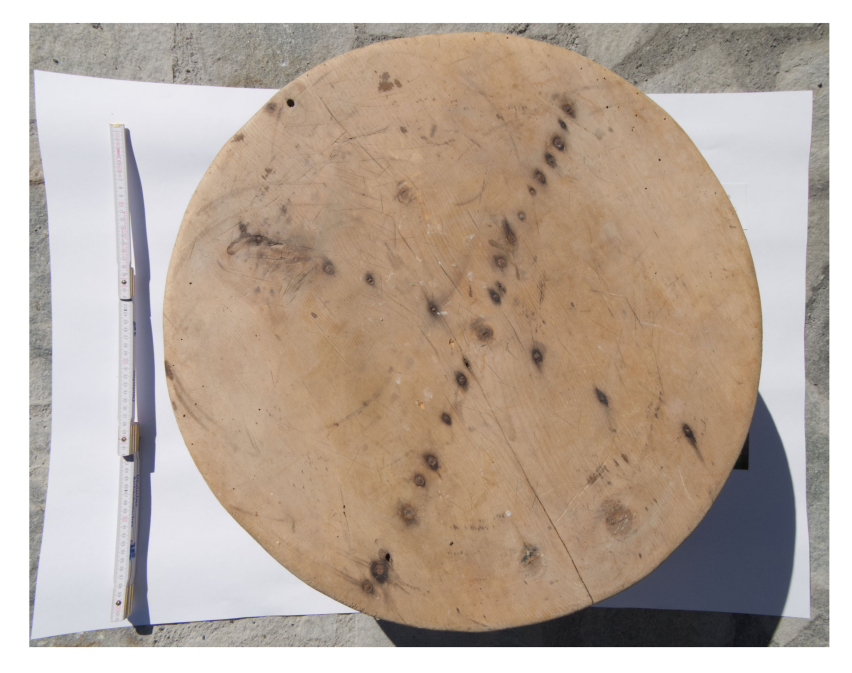
Figure 1. A sofras table, part of an ethnogrpahic collection recorded in Samarina, 2022.

populations practicing seasonal pastoral transhumance, but they are all characteristic of the materiality of the northern Greek Vlach communities. While the emergence of Vlach transhumant pastoralism did not depend upon the existence of any of these classes of artefacts, their entanglement is undeniable, and their meanings can only be understood in relational terms within specific spatial and temporal circumstances. The meaning of the individual objects similarly changes in association with the individuals that used and still use them, the social settings of their circulation and an ever-changing assemblage of other elements of material culture. The shifts in their meaning are inseparably tied to changes in what transhumant pastoralism is, within a specific historical and geographical horizon. Understanding the latter is not possible without situating the people who practice it within the broad meshwork of relational connections, within which the three objects are also integrated.