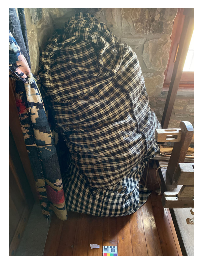
Figure 2. Haragia, part of the Eleni Kazakou collection, in the typical black and white pattern of Samarina.

or a team of people who are specialists on the topic and apply a specific methodological approach. Hence the produced account may capture different meanings and relational connections an object can have during its 'lifetime' or 'journey' depending on whether the output is outlined as a biography or an itinerary. The second area of discussion is on the consumption of the account itself. As mentioned in the introduction of this paper, object biographies/itineraries are utilized in heritage education and community engagement as mediums to communicate stories based on tangible assets. However, the biography/itinerary that is usually shared is the output of a certain group of disciplinary specialists that might occasionally be distant from the audience.