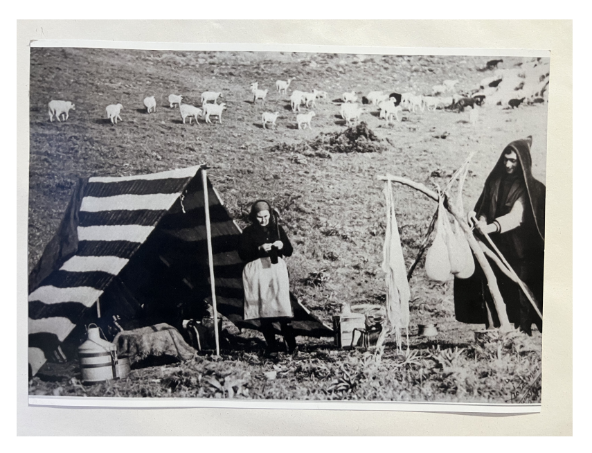
Figure 4. Vlachs of Samarina at a konaki during the annual movement. Sofras is visible at the entrance of the tent ('tsantila') covered by a cloth.

1985, 27–28). While a small portion of the Vlach communities emerged from sedentary mixedfarming components (see e.g. Dasoulas 2019 for the Vlachs of Metsovo), livestock breeding diachronically constituted the backbone of the majority of Vlach economies and transhumance was instrumental in defining Vlach group identity. It must be noted, though, that treating the Vlach-speaking populations of northern Greece as an ethnic minority is a sensitive and politically charged matter, due to the integral role of Vlach initiative in the Greek revolution of independence in the 19th century and the conflation of Greek nationality and ethnicity in the modern Greek historical and political discourse (Karakasidou 1993; Nitsiakos 2007). The combination of these two factors has resulted in the dominant self-identification of the Vlachs of northern Greece as a segment of Hellenism with distinct cultural heritage, rather than an ethnic minority, unlike other Vlach-speaking populations in the Balkans (Tanner 2004, 201–216).