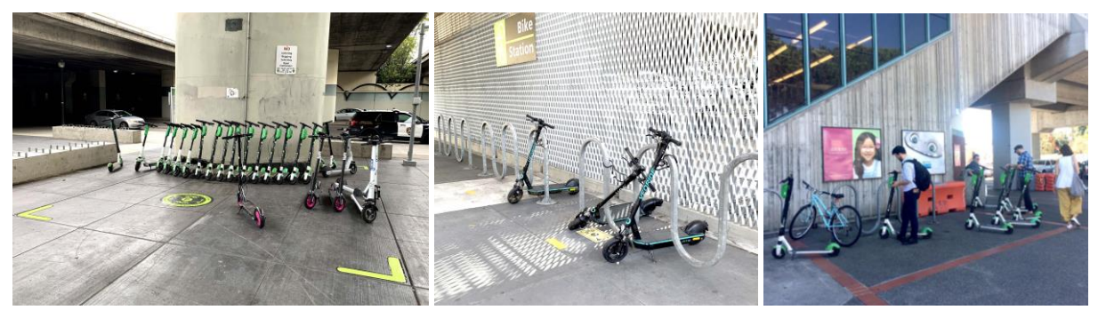
Figure 2. MacArthur BART station e-scooter coral parking Figure 3. MacArthur BART station e-scooter lockable bike rack corral Figure 4. W. Oakland BART station with e-scooter blocking racks in the absence of a corral

Parking corrals are an analogous facility to docking stations for shared dockless e-scooters and e-bikes, providing designated parking and reliable access. Corrals were present at only two stations (Figures 2-3). In the absence of corrals, shared dockless vehicle users are left without direction as to where to locate or drop off a vehicle (Figure 4). Oakland recently started requiring that all e-bikes and e-scooters be locked to a bike rack or street sign when parked (Figure 3). This prevents the vehicles from blocking a sidewalk but creates the need for more bike racks to have room for both private and shared bikes and scooters.