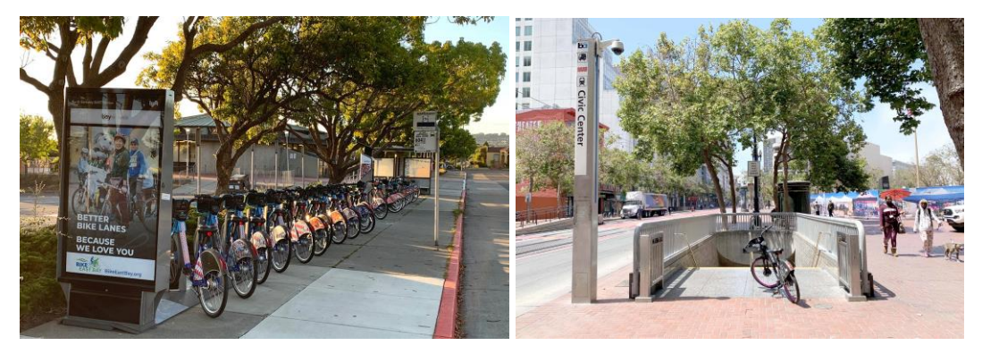
Figure 5. North Berkeley BART bay wheels bike share kiosk Figure 6. Bay wheels e-bike parked at the top of the civic center BART station stairs