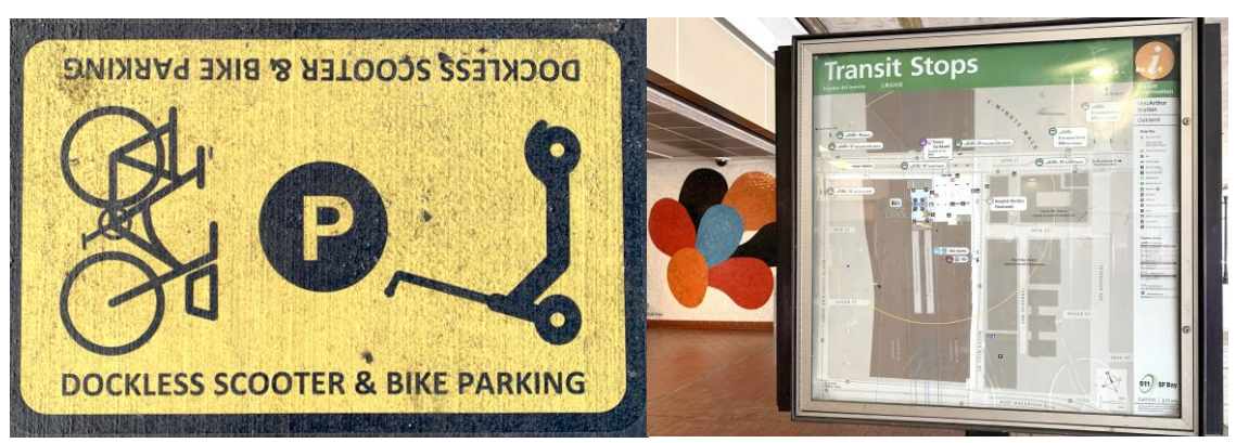
Figure 7. BART dockless scooter & bike parking sticker marking parking corral Figure 8. Map of transit stops around the MacArthur BART station that does not show bay wheel kiosk or the parking corral for shared dockless e-scooter and e-bikes

Other micromobility-supportive station features include signage, e-bike and e-scooter charging stations, bike repair services, and multilevel access and fare gate affordances for riders traveling with private bikes or scooters. Shared micromobility signage was only observed at the two stations with corrals (Figure 7), indicating where users should drop off their scooters and bikes. Signage for bus schedules and maps of stations and surrounds were prevalent, but none included place markers for Bay Wheels docking stations or corrals (e.g., Figure 8).