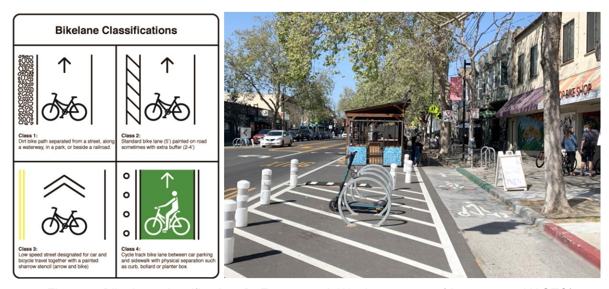
Figure 9. Bike lane classification. B. Ferguson, J. Wattimena, 2021 (data source: NACTO) Figure 10. Short segment of protected Class 4 cycle track on telegraph ave. Oakland, CA

All stations had at least some nearby street segment without any type of bike lane. Most stations had nearby Class 2 classic bike lanes (84%) and/or Class 3 bike boulevards (shared with cars; 84%). Class 1 separated bike paths and Class 4 protected cycle tracks, which are safer and more comfortable facilities, were found near 37% and 16% of stations, respectively (Figure 10). There was a lack of consistency in the bike lane networks noted, including intermittent Class 2 bike lanes and Class 3 bike boulevard on the same route, bike lanes that stop altogether from block-to-block, and absence of bike lanes in streets directly adjacent to stations. Notably, there were slow streets near 58% of stations. Slow streets have been implemented in many cities in response to the COVID-19 pandemic (including San Francisco and Oakland); a segment of street is closed to through traffic in order to support walking and biking.