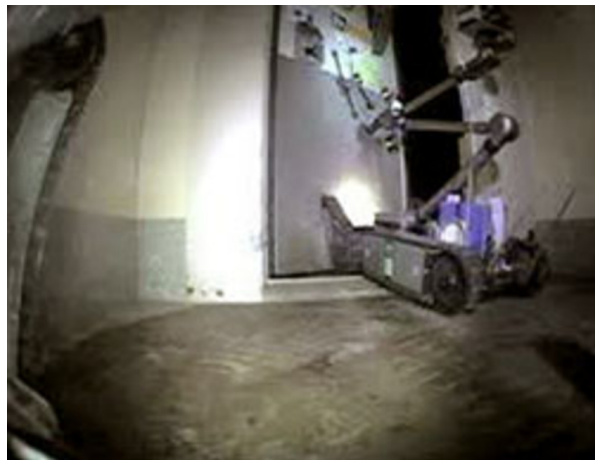
Packman: A PackBot, U.S.-made remote-controlled machine, opens a door to the main reactor building of unit 2 at the Fukushima No. 1 nuclear plant on April 18.

On March 17, six days after the crisis erupted at the Fukushima No. 1 nuclear power plant, a list was presented to Washington through diplomatic channels seeking U.S. assistance.