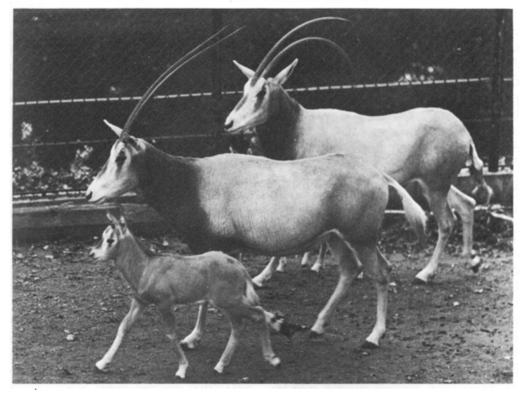
Scimitar-horned oryx (Zoological Society of London).

H. marginata remain in the wild and this species is among the plants offered for sale by a UK nursery. It is listed in Threatened Plants of Southern Africa* and is difficult to cultivate, as are H. lockwoodii and H. pulchella which are also rare and also on sale. Haworthia spp, along with many other rare succulents, have no protection under CITES as yet.