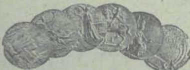
Gold Medal Allahabad 1910.

Paris 1900, Brussels 1910, Buenos Aires 1910.