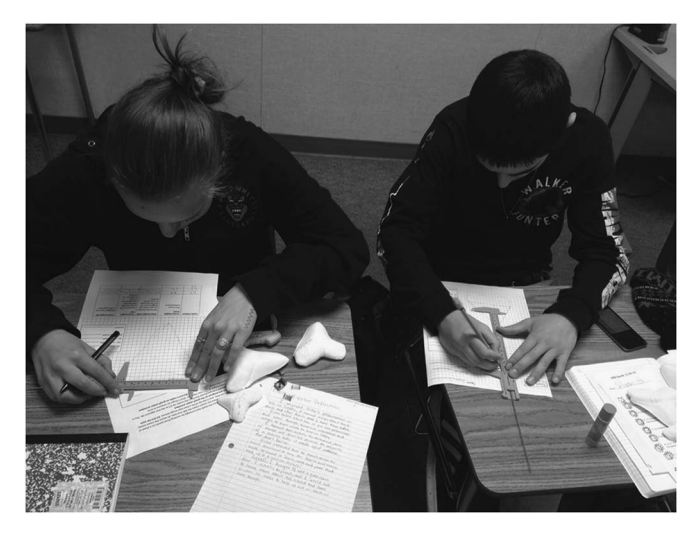
FIGURE 2.—High school students manually converting tooth crown into a triangle and measuring crown height from a 3-D printed tooth.

Each student (depending on classroom size) is assigned the task of measuring one to three teeth (Fig. 2).