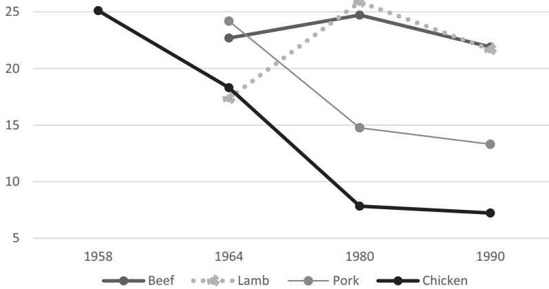
Figure 1. Meat prices in relation to the general consumer price index.

consumption patterns. In 1964, the Mediterranean, the region with the highest meat consumption, was also the wealthiest (Table 2). Andalusia, the region with the lowest income, was also the least carnivorous.