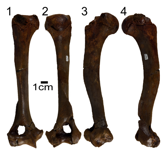
Figure 2. Borophagus sp. (ETMNH 10545) from the Gray Fossil Site, Tennessee. (1) Anterior, (2) posterior, (3) medial, (4) lateral views. Scale bar = 1 cm.

The Gray Fossil Site in Washington County, Tennessee, is an Early Pliocene (late Hemphillian or early Blancan) fossil locality, which dates to ca. 4.9–4.5 Ma (Samuels et al., 2018). The site is located in the Appalachian forests of northeastern Tennessee, making it the only pre-Pleistocene vertebrate fossil locality in the Appalachian region of the eastern United States. Studies suggest that the site was formed when an ancient sinkhole collapsed, became a small lake, and then filled with sediment over several thousand years (Wallace and Wang, 2004; Shunk et al., 2006,