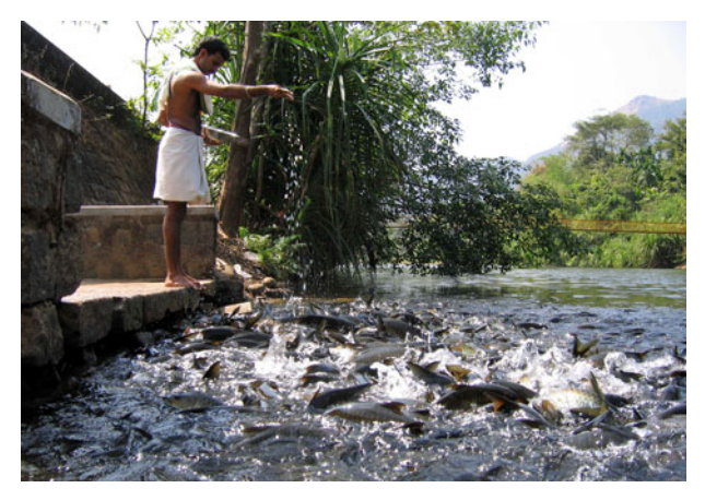
PLATE 1 The Shishileshwara temple fish sanctuary on the Netravathi River in Karnataka, India.