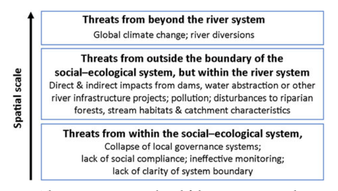
FIG. 2 Threats to community-based fish sanctuaries in India across spatial scales.

Threats at an intermediate scale, from outside the boundary of the social–ecological system but within the river system, are also prevalent. As most fish sanctuaries are not well documented and receive little to no formal protection, they are often ignored in environmental impact assessments and development planning. Consequently, many have been lost or are under threat from hydropower dams, water diversion projects, development