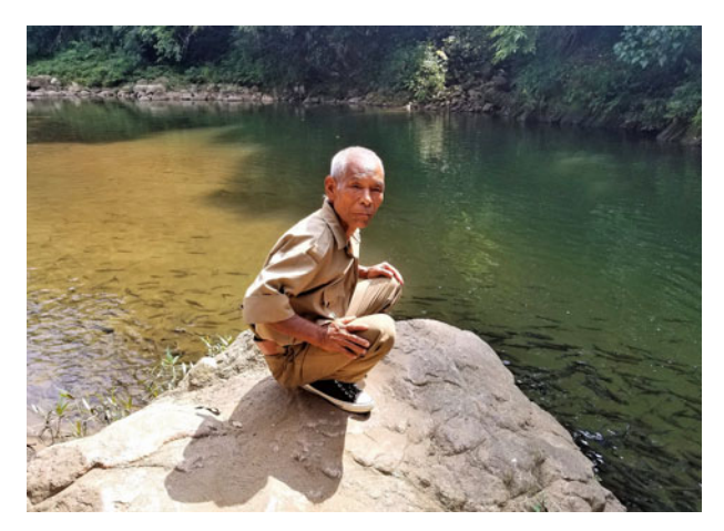
PLATE 2 Protector of the Wachi Wari fish sanctuary, a community-based conservation reserve in West Garo hills, Meghalaya, India.

realized is driven further by the policies and institutions governing these sanctuaries (Kalaba, 2014), which vary across sanctuary types.