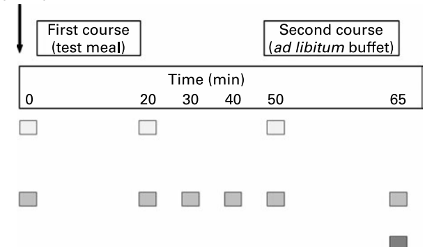
Fig. 1. Schema of the protocol that subjects underwent at the five experimental sessions, each separated by at least 1 week. In random order, subjects consumed, over 20 min, one of the five meal conditions; (1) control (water); (2) a high-protein (HP) meal with monosodium glutamate (MSG) and inosine monophosphate-5 (IMP-5); (3) a HP meal with no added MSG; (4) a HP meal with MSG only; (5) a sham-fed HP meal with MSG and IMP-5. Conditions 2 to 5 consisted of a bowl of vegetable soup and a wholemeal bread roll containing minced beef and salad and were isoenergetic. The control consisted of an equal weight of water. Subjects were given 20 min to completely ingest each of the conditions 1 to 4. For the sham-fed condition, subjects chewed the food and expectorated it at the time when swallowing would normally occur to represent oral stimulation. At 30 min later they were allowed to eat whatever they wanted until they were 'comfortably full/satisfied' from a buffet containing six protein-rich and six carbohydrate-rich foods (i.e. the second course). At t = 0, 20 and 50 min, blood was taken for determination of glucose, insulin and glucagon-like peptide 1 ( \Box ). At t = 0, 20, 30, 40, 50 and 65 min, 100 mm visual analogue scales were completed (□). At 65 min, energy and macronutrient intakes eaten at the buffet meal were assessed (.....).

fasted for 12h (water to prevent thirst, if necessary, was allowed overnight). Subjects were instructed to eat (or sham eat) the respective conditions over 20 min (these conditions represented a first course). Before and at several times after each first-course meal, 100 mm visual analogue scales were completed to assess pleasantness of taste of the meal and appetite. In addition, blood was taken via an intravenous catheter on the back of the hand to measure plasma markers of satiety (glucose, insulin and GLP-1). After 30 min later, a buffet containing six protein-rich and six carbohydrate-rich food items were offered to subjects and they could eat whatever they wanted over 15 min or until 'comfortably full' (the buffet represented a second course). Energy and macronutrient intakes eaten at the second course were determined. Appetite ratings before and after the second-course buffet were also collected.