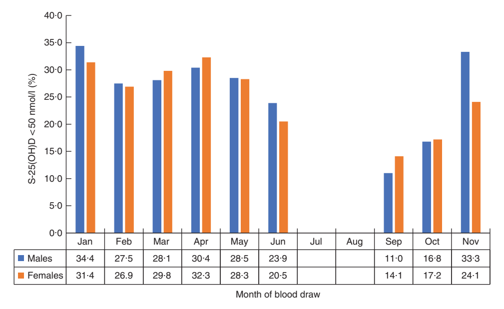
Fig. 3 Percentage with 25-hydroxyvitamin D (S-25(OH)D) concentration <50 nmol/l in males and females, by month of blood draw, in the SAMINOR 2 Clinical Survey of adults aged 40–69 years in northern Norway (68–70°N), 2012–2014 ( n 4465)

According to the final multivariable regression models, for every additional 1 \mu g/d (40 IU/d) increase in dietary vitamin D intake (including liquid cod-liver oil intake), S-25(OH)D increased by 0.49 nmol/l in males and by 0.51 nmol/l in females (models 2 and 4 in Table 3).