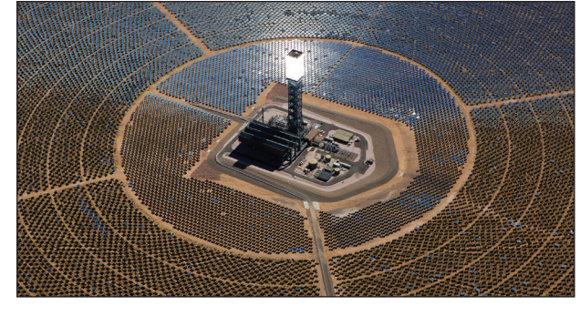
Mirror assemblies that focus the power of the sun on solar receivers atop power towers at the Ivanpah Solar Electric Generating System in California's Mojave Desert.