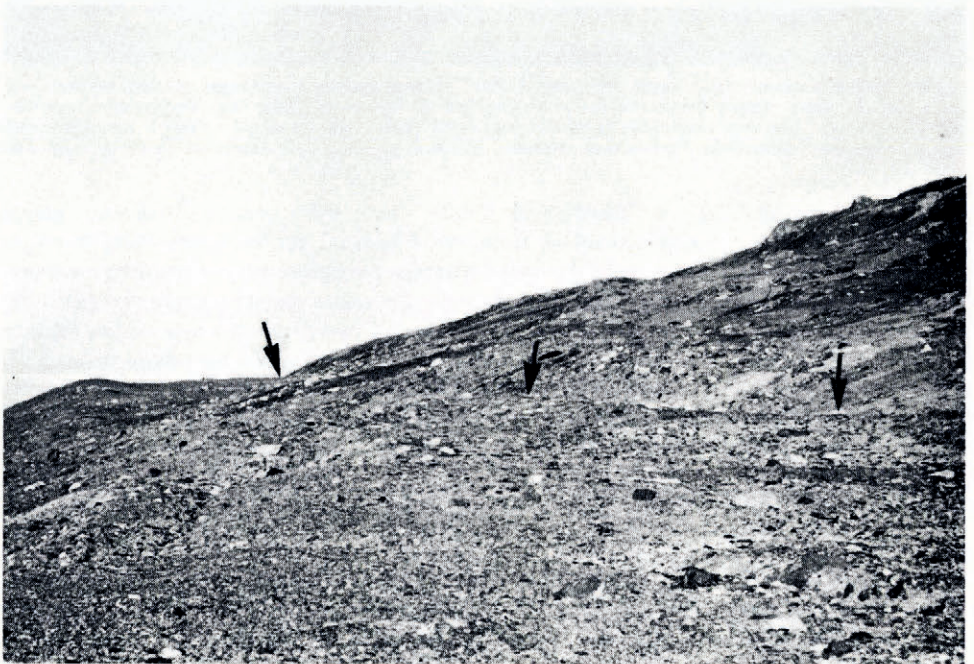
Fig. 5. View looking southward along the surface of the ice-shelf moraine, west side of the lower Daly River. Black arrows point to break in slope where one enters weathered bedrock and sparse Greenland erratics.