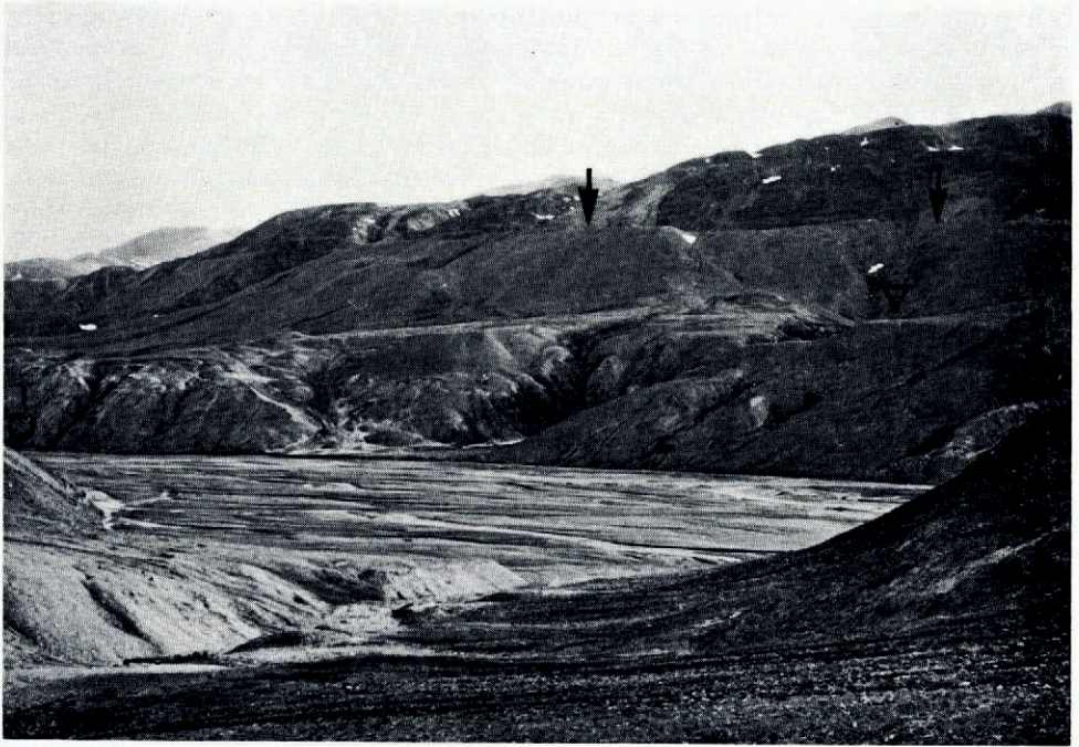
Fig. 4. View looking south-westward across lower Daly River to ice-shelf moraines c. 195 m a.s.l. (black arrows). Down-slope is a 50 m thick section composed of fossiliferous till (T) overlying bedded sands containing organic debris (open circle). Superimposed over this section are terraces at c. 105 m a.s.l. which appear to be equivalent to the pro-glacial terrace down-valley dated 27\,950 \pm 5\,400 B.P. (St. 4325). Site of amino-acid age estimate ( > 35\,000 B.P.) is shown by open triangle.