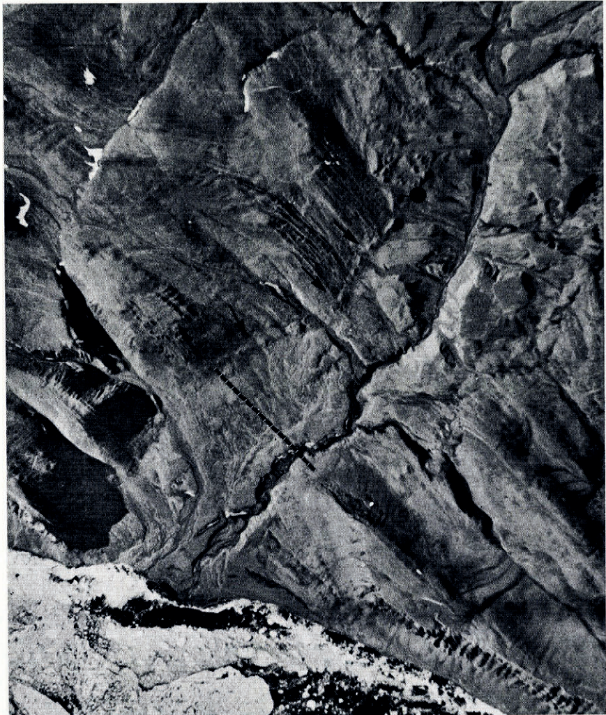
Fig. 2. Air photograph of "Beethoven Valley" showing the horizontal ice-shelf moraines (black arrows) and the approximate grounding line (black circle). Dotted line shows the approximate outer limit of this ice shelf based on morphologic evidence.

The uppermost Ellesmere Island moraines in the interior of Judge Daly Promontory occur at c. 500 m a.s.l. and descend to c. 260 m a.s.l. at the entrance to lower "Beethoven Valley" (Fig. 1). Within 0.5 km of this latter point, a well-developed system of conical kames and lateral moraines descends steeply down-valley to an elevation of 200 m a.s.l., where they become abruptly horizontal for a distance of c. 2 km. Immediately up-slope from these horizontal lateral moraines one encounters a sharp break in weathering characterized by deeply oxidized bedrock, tors, and a sparse distribution of crystalline erratics previously deposited by the Greenland ice sheet. The horizontal moraines are considered to represent the lateral margin of a floating outlet glacier whose grounding line was located at the lowermost sector of steeply sloping lateral moraines up-valley. Vertical and ground-level view of