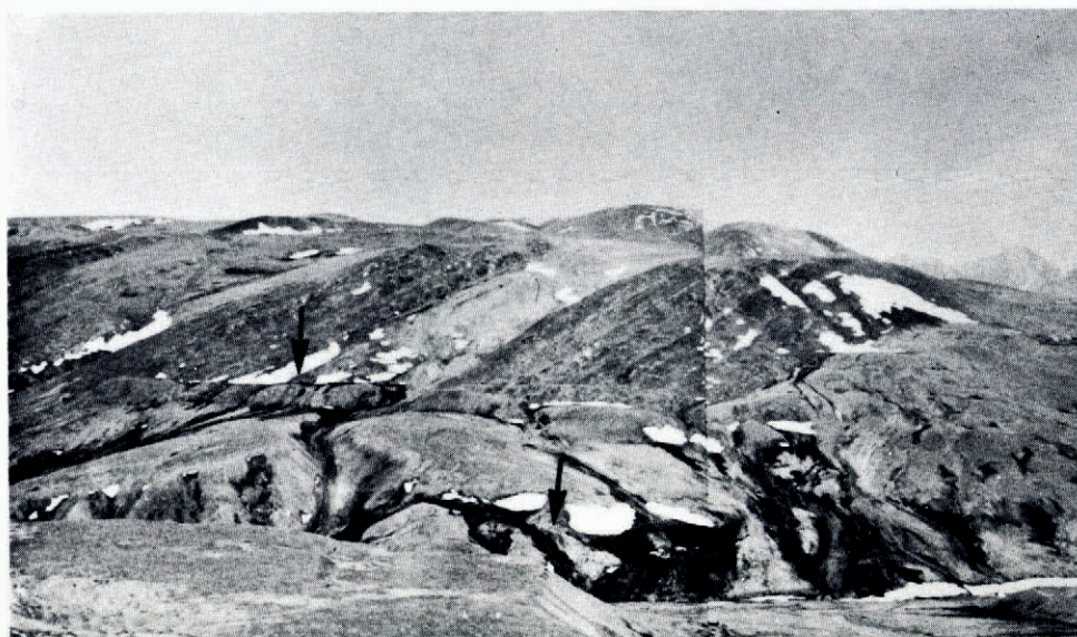
Fig. 3. View looking southward across upper "Beethoven Valley" showing segment of horizontal ice-shelf moraines ( c. 200 m a.s.l.) and the steeply sloping lateral moraines extending into the interior of Judge Daly Promontory ( c. 260 m a.s.l., right background). Note slight depression in the moraines at the contact with the former ice shelf. Associated pro-glacial marine terraces occur down-slope from ice-shelf moraines. Locations of dated shell samples are shown by black arrows.

these moraines on the south-west side of "Beethoven Valley" are shown in Figures 2 and 3, respectively. The slope of the moraines shown in Figure 3 compares with observations made on the Ross Ice Shelf, Antarctica, whose profile is characterized by "(i) the abrupt increase in elevation as one goes from the ice shelf on to the continental ice sheet and (ii) the depression associated with the juncture of the ice shelf and ice sheet" (Theil and Ostenso, 1961, p. 825). Several altimeter transects, corrected for both temperature and pressure, were run along the entire horizontal sector of the "Beethoven Valley" moraines and no elevation differences > 1 m were detected. Similar, but less extensive, lateral moraines occur on the opposite side of the valley and suggest an ice-shelf width of c. 2 km.